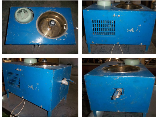
Figure 2: Electro-Mechanical Yam Pounding Machine