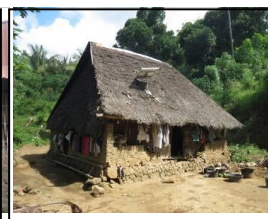
Figure 5. Home of Pasek Celagi Residents

The making of traditional Balinese building structures is highly paying attention to details. Some part of the building's structure size depends on the size of body part from the head of family. Starting from determination length and width of yard and saka , the distance between saka , the number of iga-iga , and some other structures. Saka structure has very detail size. The homemaker sets the height and width of the saka , also the distance between the carvings and sculptures. The rules of the size came from the reason of rational and related to the magical aspect. The community believes if a measurement error occurs, it will have an impact on the economic and social life of the homeowner and his family.