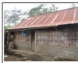
Figure 4. Home of Pasek Trunyan Residents