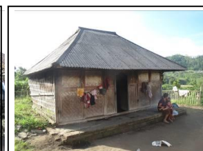
Figure 3. Home of Pasek Kayuan Residents