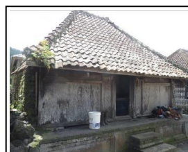
Figure 2. Home of Pasek Kayuselem Residents

In fact, Saka Roras house model of Balinese society in Kintamani region varies. Between one village and another, there are some differences. Even in the same village, there are also differences in certain parts. Here are some models of Saka Roras houses that have been documented.