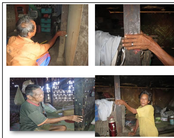
Figure 7. The width of the saka is equal to the length of the index finger

In theory, a rai is the length from the tip to the base of the index finger. Moreover, referring to the written text, measuring the bone segment on the outside of the index finger obtain the size of a rai . According to our observation, there is little difference between theory and application in society. From the interview with some elders of Bali Mula , there is an information that a rai is the distance from the tip of the index finger to the curve of the skin on the inside of the palm. The information from the community is in line with the fact that the width of Saka from Saka Roras' house is exactly the same as the length of the inside of index finger some resident.