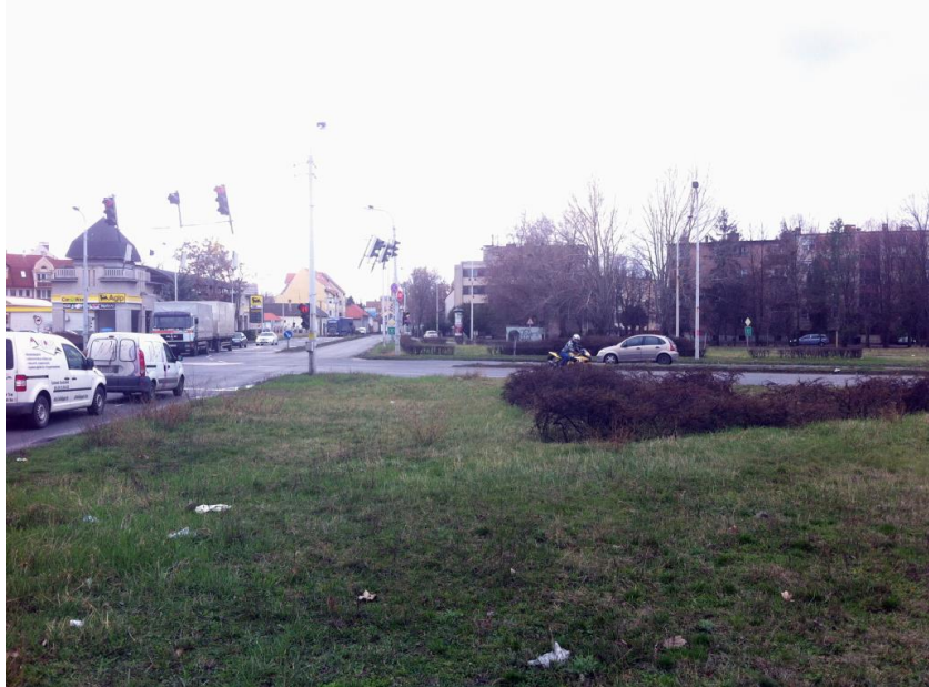
Figure 3. Kecskemét Buda Kapu Crossing (a contaminated place by toxic elements)