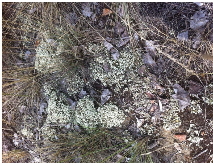
Figure 2. Cladonia magyarica lichen colonies on sand dunes

Lichen colonies were collected from the Kiskunsági National Park ( Figure 2 ) and were placed in Kecskemét Budakapu Crossing ( Figure 3 ). This later placed is heavy polluted because of the traffic.