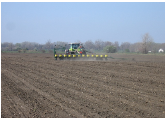
Figure 1. Ripping technology soil preparation

The research was carried out in the fields of Hód-Mezőgazda Zrt, Hódmezővásárhely, where the sowing took place in seed beds prepared for sowing in two different ways. One of the fields was prepared with the traditional technology (disking, ploughing, seedbed preparation) ( Figure 2. ), while the other field was prepared without turning the soil (ripping technology, disking, seedbed preparation) ( Figure 1. ) for preparing maize sowing.