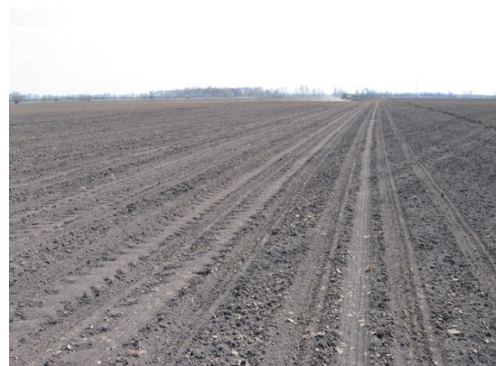
Figure 2. Plough technology soil preparation

The seedbed was suitable for sowing, porous, crumbled consistency, however there was a lack of precipitation in the period before sowing. It could be due to the low level of humidity in the soil or sometimes the uneven soil that the seed did not always get into wet soil.