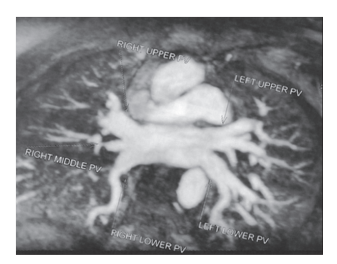
FIGURE 1. Preprocedural imaging of the left atrium and pulmonary veins by magnetic resonance imaging exhibited a right middle pulmonary vein and a perpendicular outlet of a right lower pulmonary vein.

Left inferior, right superior and right middle PVs were isolated. Minor electrical activity was present within the left superior PV while right inferior PV was completely reconnected. Then, a 28-mm Arctic Front Advance™ balloon was inflated and advanced to the ostium of left superior PV and an application of 180 seconds was delivered since isolation was evident after only 25 seconds of ablation. Occlusion of the right inferior PV could not be achieved with a direct approach, the pull down technique or the big loop technique as presented by