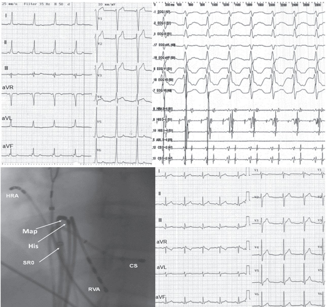
FIGURE 1. Preexcitation was manifest on the 12-lead electrocardiogram (ECG) (left upper panel) when the patient returned for a second radiofrequency ablation procedure due to recurrence of symptoms. During the procedure an anteroseptal accessory pathway was localized in close proximity to the bundle of His (No. 9 / His-D recording at the right upper panel indicates very short ventriculo-atrial interval during the supraventricular tachycardia). This accessory pathway was successfully ablated with the assistance of a long sheath (SR0) which stabilized the ablation catheter (Map) (left lower panel). After the procedure a normal 12-lead ECG is recorded free of preexcitation (right lower panel). CS = coronary sinus; HRA = high right atrium; RVA = right ventricular apex.

with mild tricuspid valve regurgitation and no interatrial communication. This better explains the difficulties encountered during the first ablation procedure when the right lateral concealed accessory pathway required multiple attempts before successful ablation and in view of non-use of the stabilizing sheath, which immensely facilitated the second procedure.