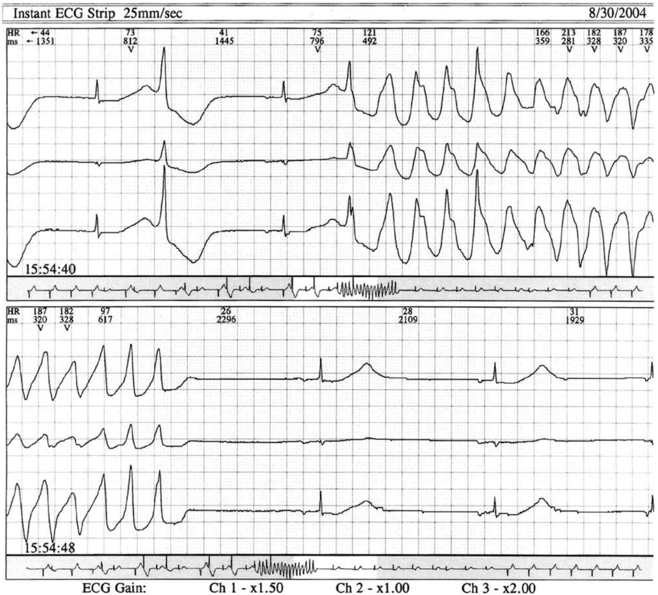
Figure 2: Self-terminated episodes of TdP preceded by the characteristic short-long-short sequence.

a less than 1% (0.7%) TdP, amiodarone is reasonably considered one of the safest antiarrhythmic options for supraventricular arrhythmia prevention in ischaemic or structural cardiomyopathies, specially knowing the unfavourable effect of other anti-arrhythmic drugs in patients with underlying structural heart disease (CAST, SWORD studies). 6