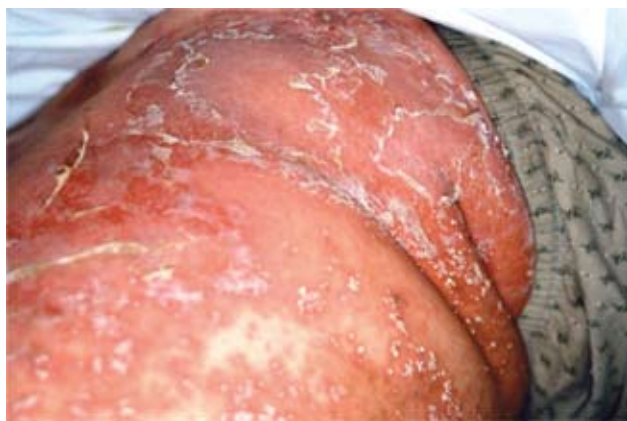
PICTURE 1. Generalized eruption with multiple small pustules.

Psoriasis is a chronic, inflammatory skin disease affecting approximately 2% of Caucasians, but it is rare among Japanese, Eskimos, West Africans, and North American blacks and very uncommon in North American and South American natives. The cause for these variations is likely to be both genetic and environmental [5]. There is a considerable epidemiologic verification that genetic factors determine the pathogenesis of psoriasis. The disease is multifactorial in origin and has a