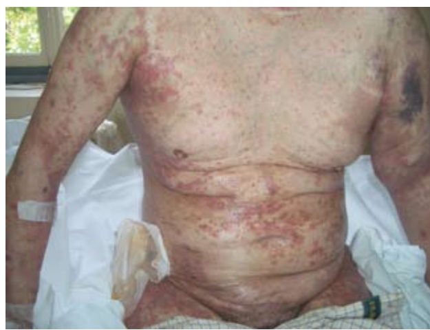
PICTURE 2. Generalized pustular psoriasis of the body and upper extremities.