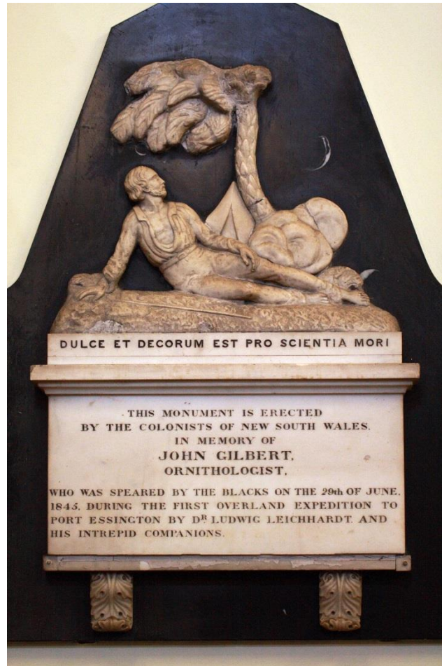
Figure 1: Memorial to John Gilbert on the wall of St James's Church, Sydney

The mural tablet memorial to the naturalist-explorer-collector John Gilbert in Saint James's Church, Sydney, bears the Latin inscription Dulce et decorum est pro scientia mori ("it is sweet and fitting to die for science"). A variation on the lines of the Roman poet Horace in The Odes (Book 111), the inscription substitutes scientia for patria (country) reinforcing the perceived link between scientific and imperial progress. 1 Gilbert was killed in June 1845 during a retaliatory night attack on members of the first Leichhardt Expedition by a party of Kokopera (Gugu-bera) Aboriginal people at a remote campsite in Western Cape York Peninsula. He was Gould's principal and only salaried collector in the Australian colonies. Two weeks later in July 1845, Gilbert's friend and fellow Gouldian collector, Johnston Drummond, the son of Government botanist and Western Australian settler James