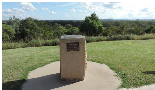
Figure 2: Memorial to John Gilbert, Gilbert's Lookout, Taroom, 2014.