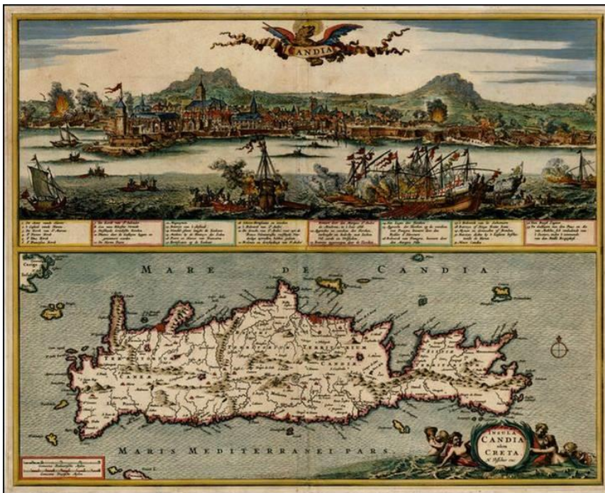
Figure 2: The Venetian Protectorate of Candia (1651) published in Marco Boschini, Il regno tutto di Candia. Delineato a parte et intagliato (Venezia: con Privilegio nelli Stati della Chiesa, e della Republica Venezia, 1651).