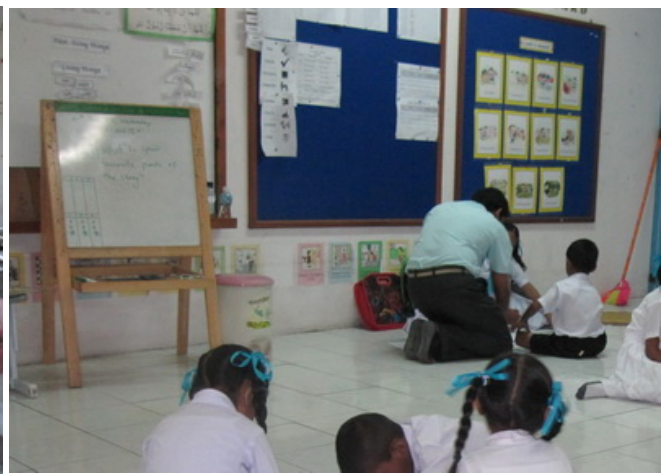
Figure 7: CFS classroom

In the non-CFS classrooms, the desks were arranged in rows and arranging group work activities could be time consuming. There were no books or extra materials in these classrooms and limited displays, which can be attributed to the sharing of classrooms with other grades in the double school session. In team teaching sessions, the local teachers were always responsible for forming the groups given their familiarity with the students. One primary teacher, with an established routine in his classes, asked students to form groups of four by having the front row turn around and directly face the students behind, thus creating instant groups, and we were able to quickly proceed with the lesson. In contrast, another teacher allowed students to walk around the room with their books and bags to form groups, resulting in a much slower start to the lesson. These two examples show how, in the same physical environment, lessons can be conducted with different arrangements and degrees of efficiency. While the limited resources in primary classrooms did provide some challenges, this example does highlight that how resources are used is also important.