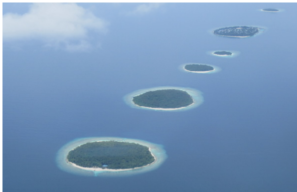
Figure 1: Maldivian islands

A key contextual feature of the Maldives is that it is a nation of islands. Royle (2001) distinguishes two features of islands: isolation and boundedness. The islands are, paradoxically, both the appeal of the Maldives—especially for tourists—yet a constraint because of their insularity and access difficulties to resources and services (Royle, 2001). The appeal of tropical islands has driven the development of tourism in the Maldives, leading to strong economic growth over the past two decades. The Maldives transitioned from developing country status to a middle-income country in 2011 through this expansion in tourism. Yet, there are some significant economic challenges facing the country. The overdependence on tourism, which accounts for 30 percent of GDP, and an over reliance on imports for goods and services (50% of GDP) are major barriers for sustainable development (Sareer, 2013). Crossley (2010) contends that small states have an ecology of their own with distinctive priorities and dilemmas. Geographical remoteness, small populations and a narrow resource base make them particularly vulnerable to global forces. Yet, due to their size small states tend to be more outward looking, seeking innovative approaches beyond their own borders to help exploit the slender resources they do have (Bacchus, 2008).