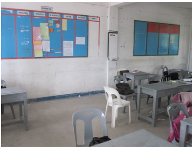
Figure 6: Traditional classroom

Johnson et al. (2000, p. 185) argue that the physical environment has a strong bearing on what teachers can do. I was able to experience the difference in teaching in the physical environment of CFS and primary classrooms. CFS classrooms were generally inviting classroom environments. UNICEF had initially supported schools implementing CFS by providing tiles for the floor and an array of classroom resources. Tiled floors enabled floor activities to take place, whereas the dusty concrete floors of non-CFS classrooms inhibited floor activities. Extra furniture also meant there was greater flexibility as to where CFS students could work.