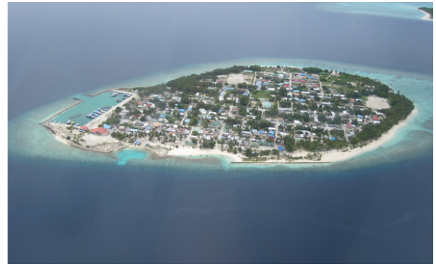
Figure 2: Inhabited Maldivian island

Consequently, education systems have a major role in helping build human resource capacity in small states (Bacchus, 2008). However, small states face distinctive challenges in delivering education to a small number of students from a restricted institutional base, across a geographically dispersed region (Crossley, Bray, & Packer, 2011, p. 8). Essentially the need is to educate students to contribute to technologically advanced knowledge economies (Bacchus, 2008; Crossley, et al., 2011) so that small states can interact in the international arena. The need for educational innovations is seen as critical to the development of small states. Yet, as Crossley et al. (2011, p. 32) argue, it is not uncommon to see tension between curricular and pedagogic reform at the national level and implementation at the school level. They state that international agendas have often dominated educational policy formation at the expense of local input and appropriate sensitivity to contextual factors at national, provincial and school levels. Therefore care is needed to ensure that curriculum and pedagogic reforms are consistent with local cultural, contextual and professional realities when striving for successful implementation (Crossley et al., 2011, p. 31).