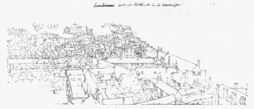
FIGURE 1: Wenzel Hollar's sketch from the tower of Southwark Cathedral, looking west towards Westminst

Globe reconstruction in London) sketch of Shakespeare's own play-house was made by the Czech panoramist Wenzel Hollar in the 1630s, not long before the playhouses were razed by the puritans: