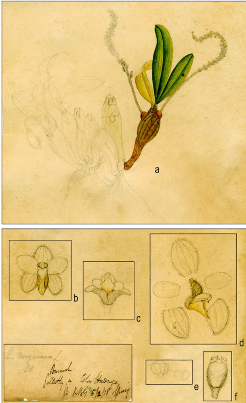
Fig. 2. Eria merguensis Lindl. a , habit; b , Flower (front view); c , flower (basal view); d , sepals, petals, lip, column and pedicel plus ovary; e , anther (left) and pollinia; f , column. [Portions of an illustration (rearranged) at CAL prepared on a herbarium sheet (with a label) possibly by Robert Pantling]