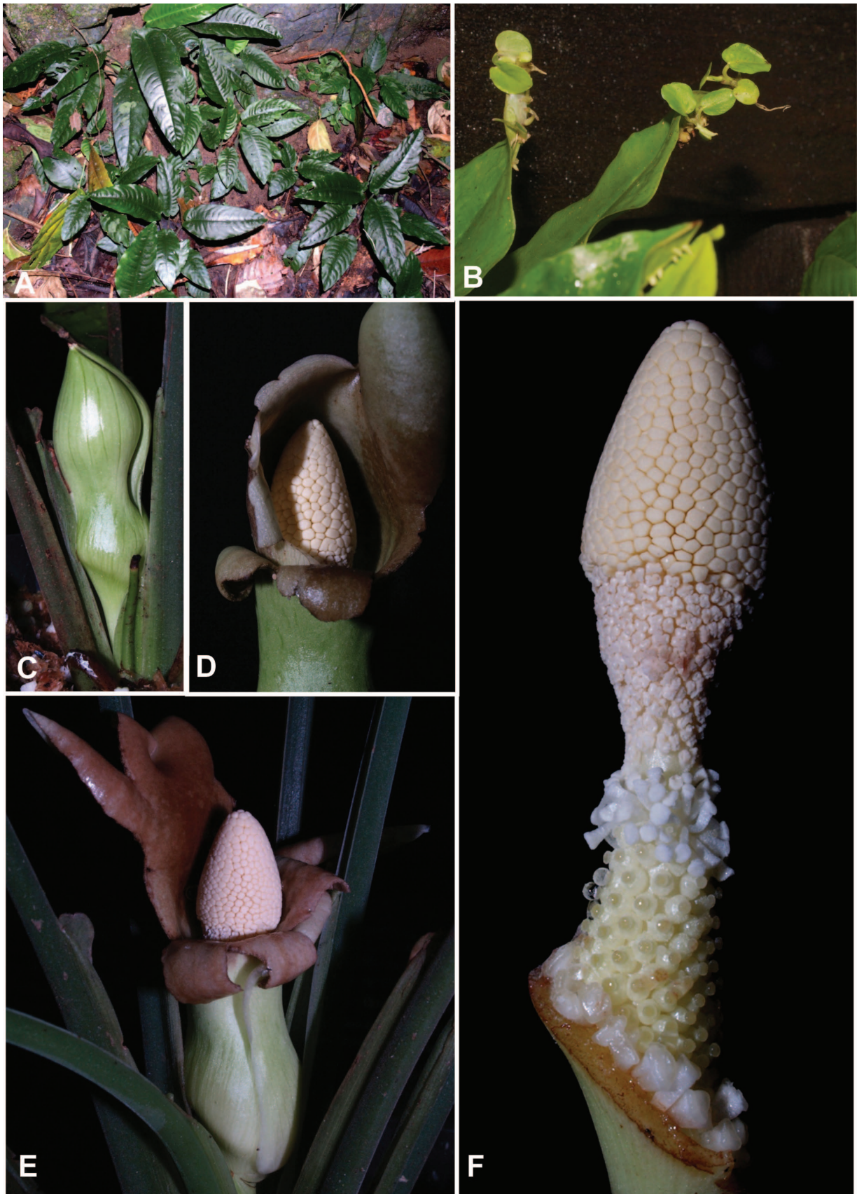
Fig. 2. Schismatoglottis hayi S.Y.Wong & P.C.Boyce. A , plants in habitat; B , adventitious plantlets on the tip of the leaf blade; C , inflorescence just prior to anthesis; D , inflorescence at onset of pistillate anthesis (note that the spathe limb had opened, darkened, and begun to split); E , inflorescence at male anthesis (the spathe is beginning to deliquesce and turn glossy, note the clearly visible pubescent petioles); F , spadix at staminate anthesis with the spathe artificially removed (note that the interstice staminodes are long and have flat tops, the distal part of the staminate zone is narrower than the base of the appendix, and that the appendix is pointed). A–F from AR-1880.