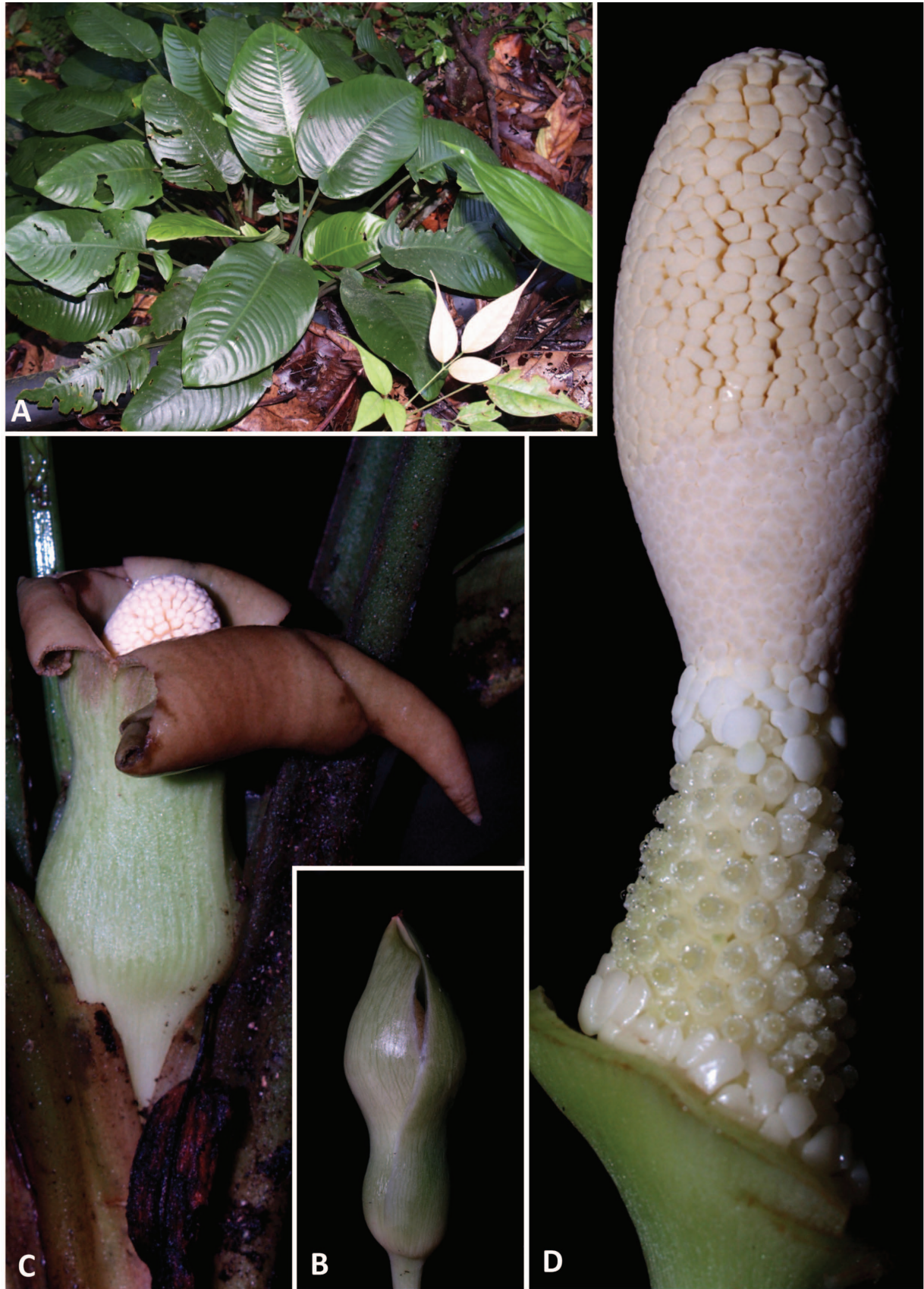
Fig. 3. Schimatoglottis multinervia M.Hotta. A , plants in habitat; B , inflorescence at onset pistillate anthesis (note the small gap that is created by the expansion of the spathe limb); C , inflorescence at onset of staminate anthesis, the spathe limb has expanded and split longitudinally, at the same time darkening, and the pubescent petiole is clearly visible; D , spadix at pistillate anthesis with the spathe artificially removed (note that the interstice staminodes are short and have rounded tops, the distal part of the staminate zone is the same diameter at the base of the appendix, and the appendix is blunt). A–D from AR-1932.