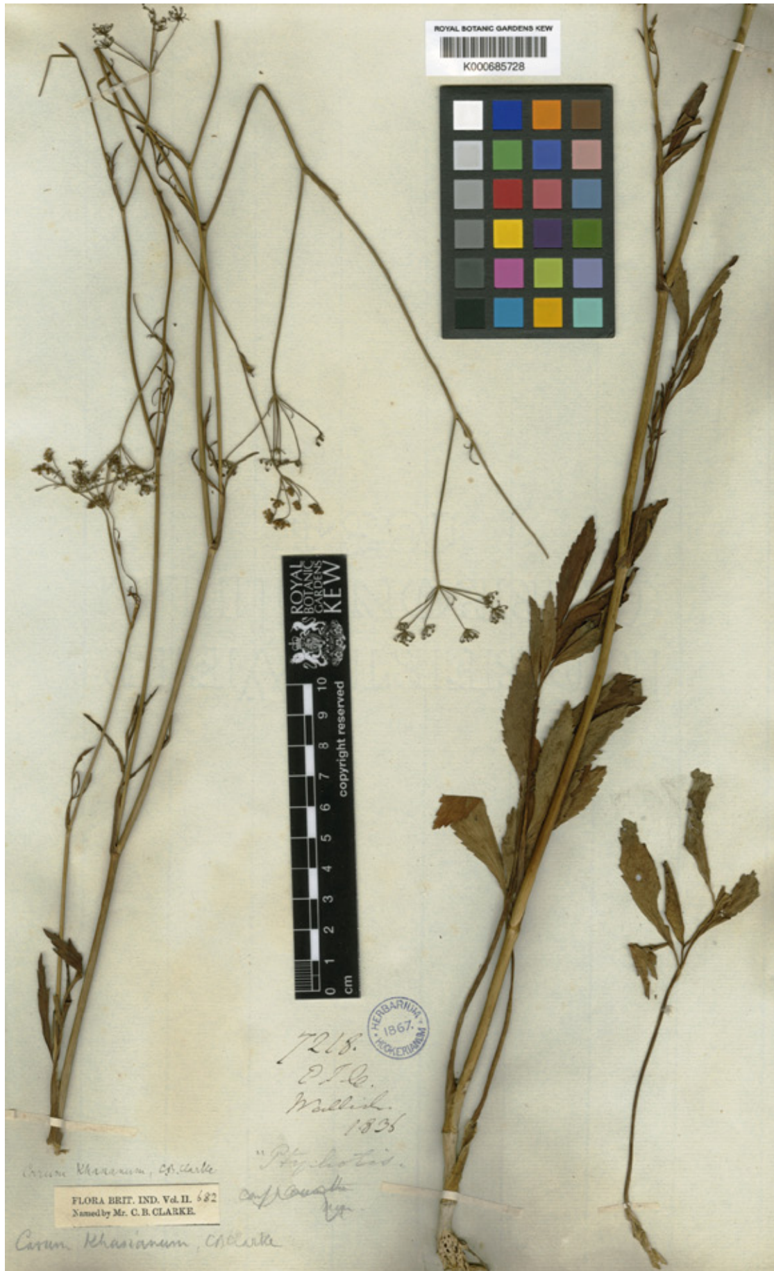
Fig. 2. Lectotype of Trachyspermum khasianum (K685728, © the Board of Trustees of the Royal Botanic Gardens, Kew).