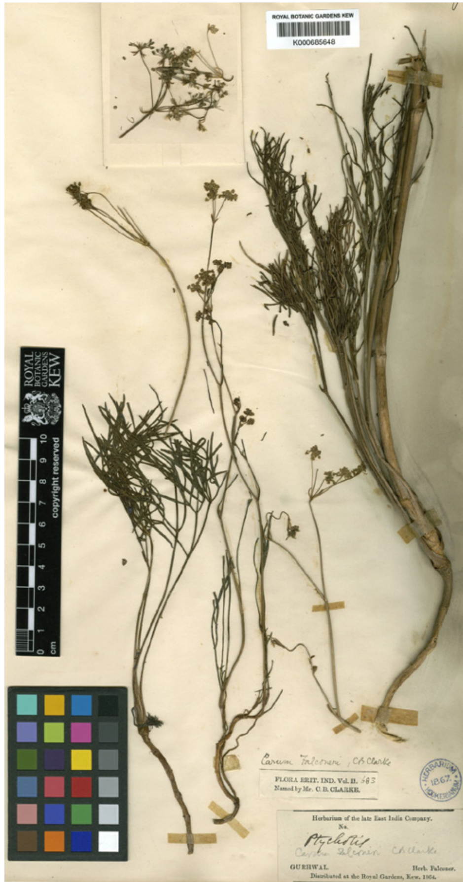
Fig. 1. Lectotype of Trachyspermum falconeri (K685648).