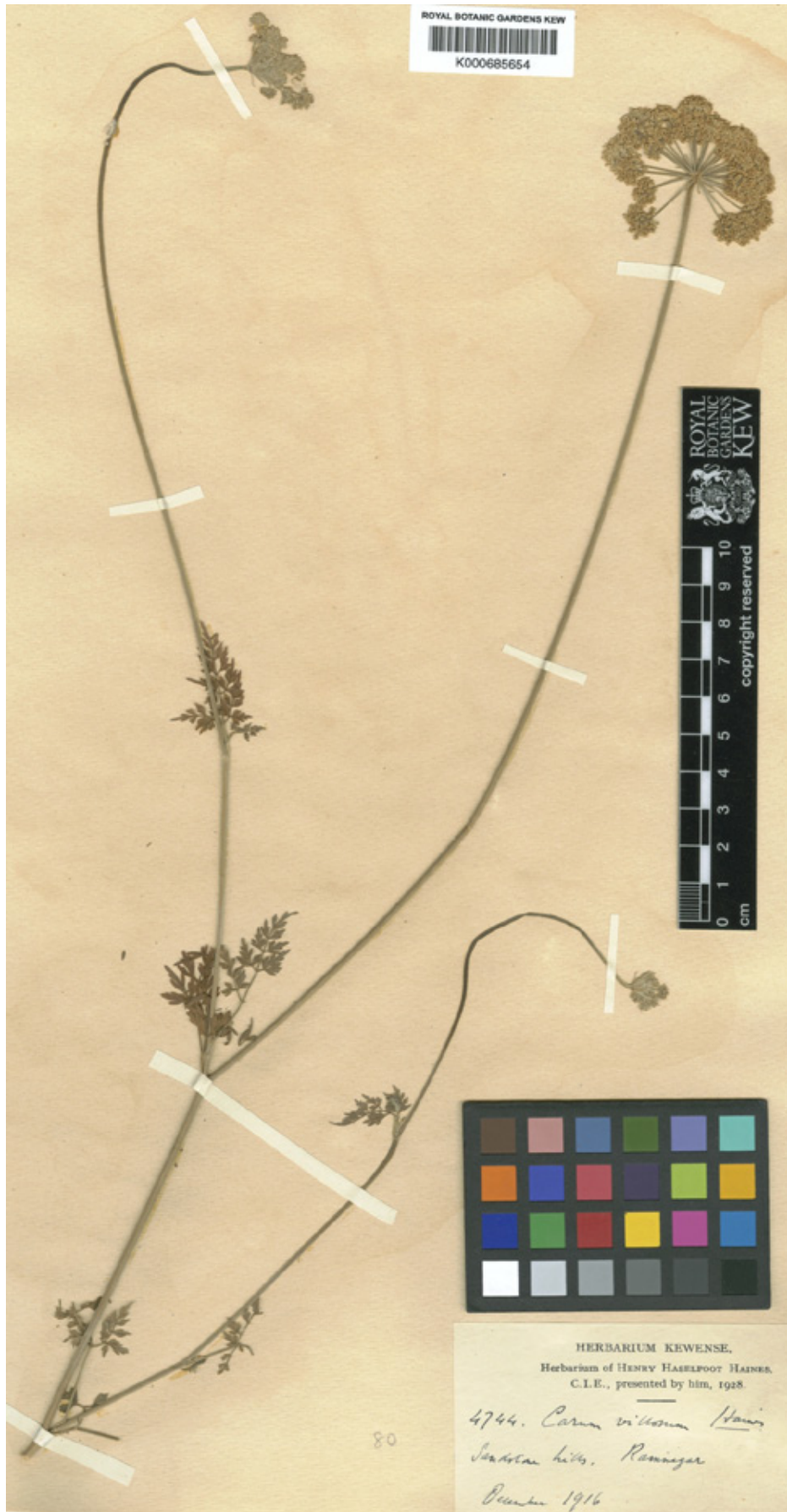
Fig. 4. Lectotype of Trachyspermum villosum (K685654).