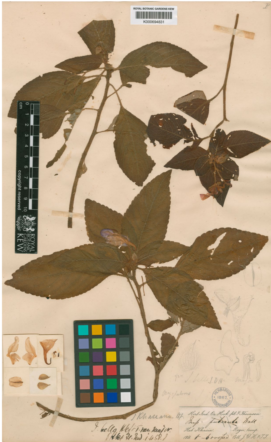
Fig. 1. Lectotype of Impatiens khasiana Hook. f., J.D. Hooker & T. Thomson s.n., (K694831!)