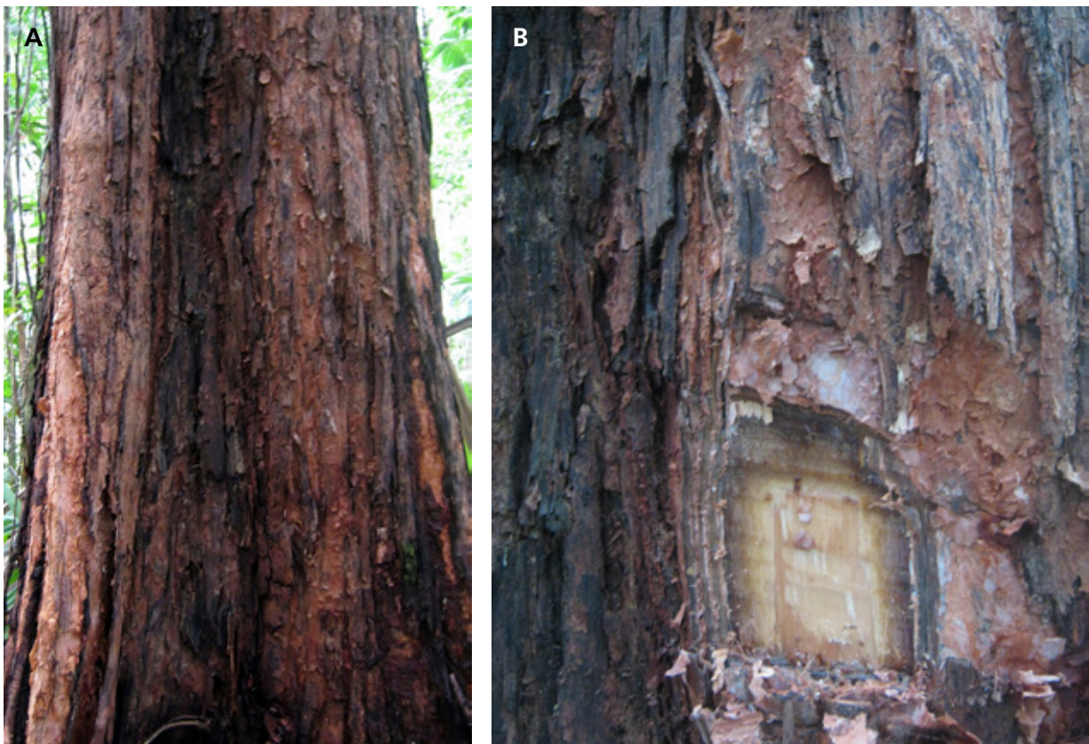
Fig. 4. Syzygium lababiense B.J.Conn & K.Q.Damas. A. basal section of trunk showing rough flaky, red-brown outer bark; B. outer bark with blaze showing single layered inner fibrous bark.

Notes: Syzygium lababiense is a minor hardwood species that is only known from the Kamiali area of the Morobe Province.