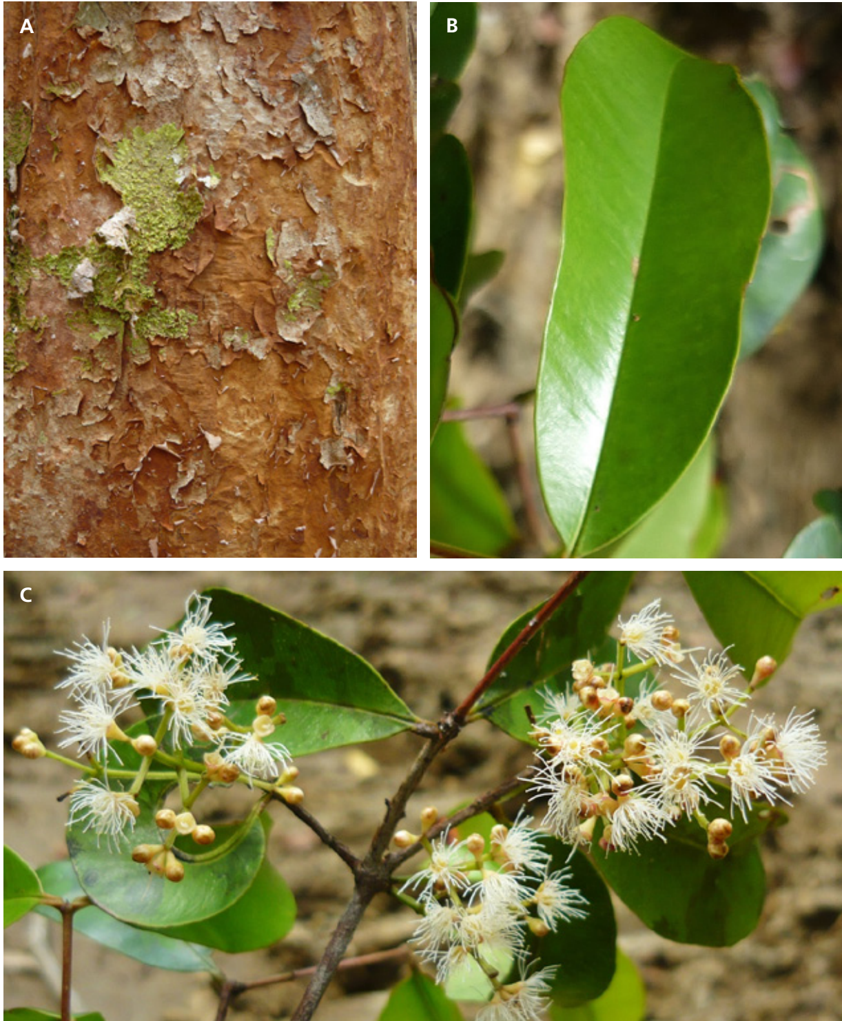
Fig. 7. Syzygium cravenii B.J.Conn & K.Q.Damas. A. basal section of trunk showing rough papery, peeling outer bark; B. details of leaves, showing the indistinct (faint) secondary veins; C. flowering branchlets showing axillary inflorescence and flowers.

Notes: This minor hardwood species is only known from the type collection.