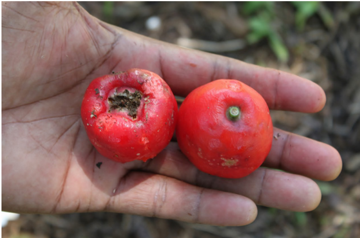
Fig. 3. Syzygium platycarpum (Diels) Merr. & L.M.Perry. Fruits, showing apical view with remains of calyx (left) and basal view with distal remains of pedicel (right).

Syzygium lababiense B.J.Conn & K.Q.Damas sp. nov.