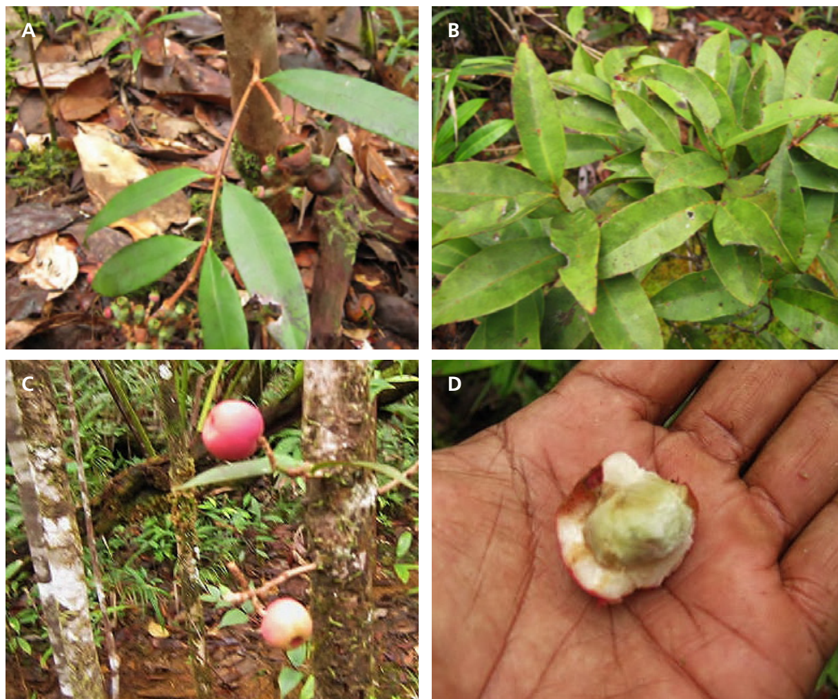
Fig. 6. Syzygium kuiense B.J.Conn & K.Q.Damas. A. leaves near base of young sapling; B. details of leaves, showing the indistinct (faint) secondary veins; C. cauliflorous fruits; D. seed exposed after some of fruit wall removed.