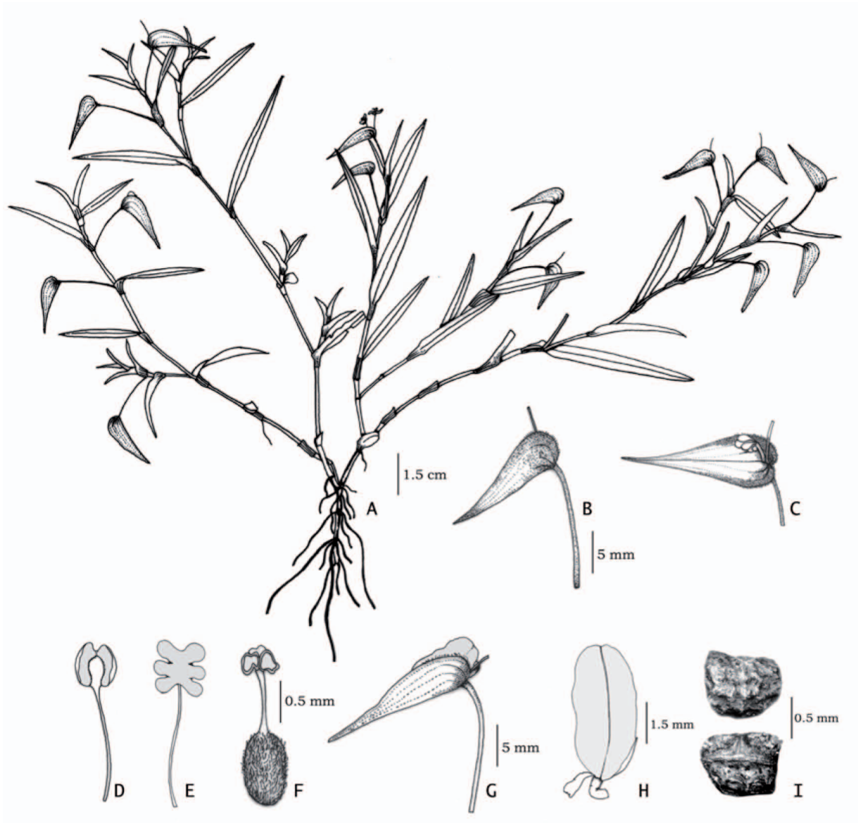
Fig. 1. Commelina badamica A. habit, B & C. flowering spathes (abaxial and adaxial view respectively), D. stamen, E. staminode, F. pistil, G. fruiting spathe, H. capsule, I. seeds (dorsal surface (above) and ventral surface (below)). A-I from Nandikar 0238 (SUK). Scale shown on figure. Illustrator: M.D. Nandikar