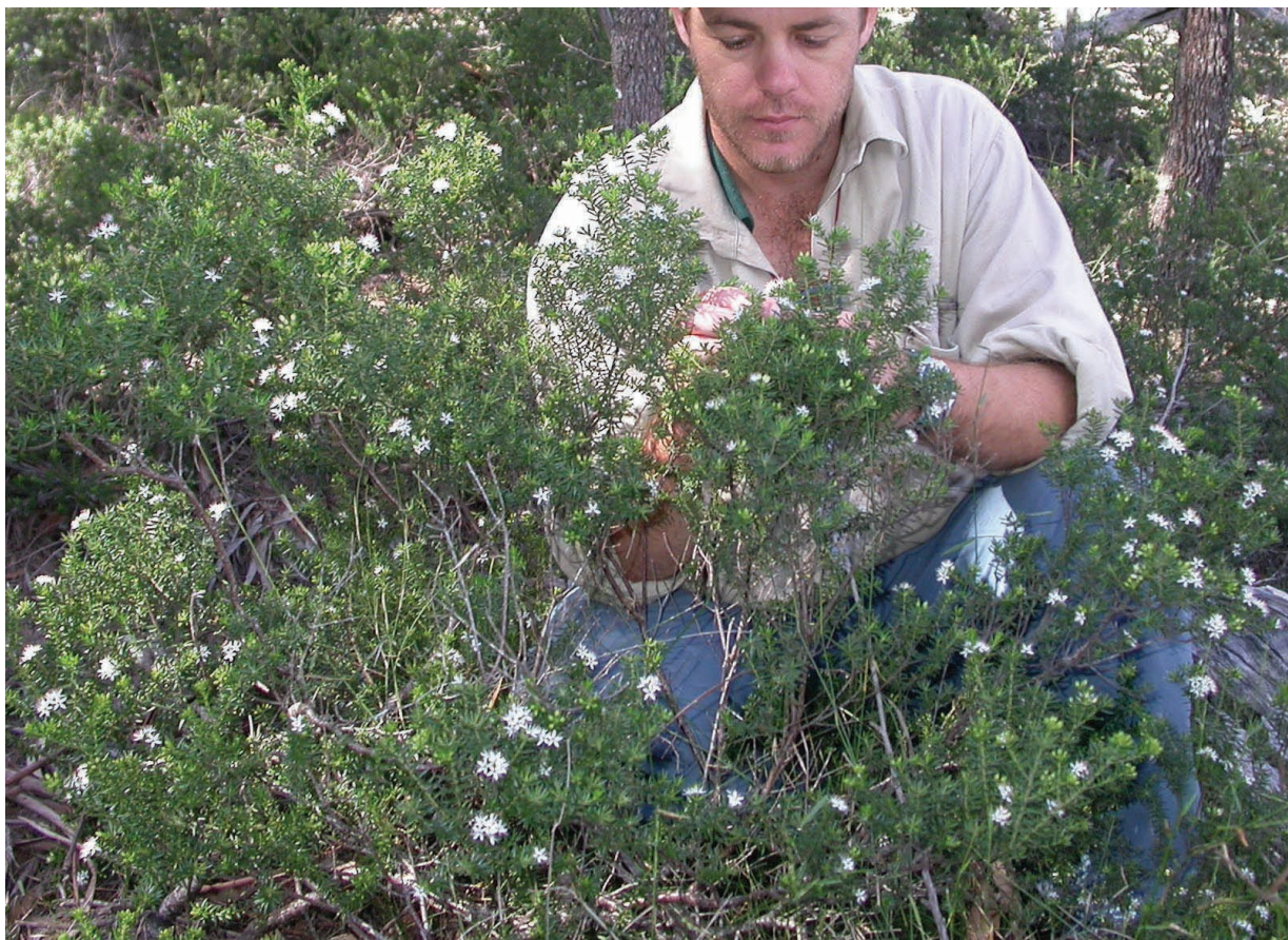
Fig. 1. Habit of Leionema westonii , L.M. Copeland 3741 et al. (type gathering).

Shrub , rhizomatous and much-branched, to 70 cm tall. Stems pilose with spreading white simple hairs. Leaves: petiole 1–1.4 mm long, sparsely pilose; lamina narrowly elliptic or linear, 6–16 mm long, 1–1.8 mm wide, obtuse, revolute, adaxially pilose, abaxially minutely white-papillose and sparsely pilose. Inflorescence a terminal cyme composed of 4–10 solitary flowers in the upper axils. Pedicels 3–5.5 mm long, pilose, bearing a subulate, pilose bracteole 2.4–2.8 mm long just below the calyx. Calyx cup-shaped, 1.3–1.6 mm long, sparsely hispidulous, sometimes with minute stellate hairs, 5-toothed, the teeth triangular, c. 1 mm long. Petals 5, spreading, narrowly elliptic, 4–4.6 mm long, 1–1.2 mm wide, acute, glabrous adaxially, glandular punctate and sparsely and shortly pilose abaxially, white. Stamens 10, exerted, spreading; filaments terete, 4–4.6 mm long, glabrous, white; anthers elliptic, 1–1.5 mm long, pink. Disc annular surrounding a gynophore c. 0.5 mm long, dark green. Ovary of 5 carpels, fused for most of their length, c. 1 mm long, 0.7 mm diam., papillose, green; style terete, 2.5–2.8 mm long, white; stigma capitate, white. Fruit and seeds not seen. Figs. 1, 2.