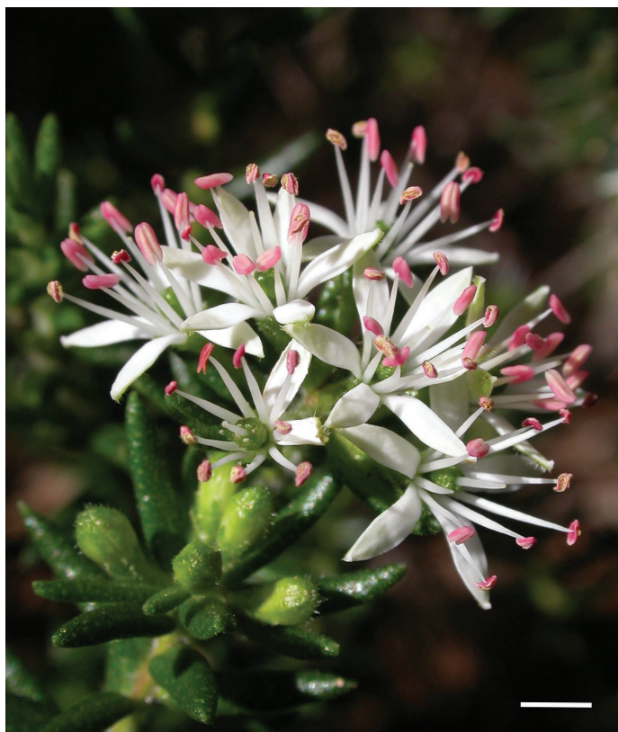
Fig. 2. Inflorescence of Leionema westonii ; from L.M.Copeland 3741 et al. (type gathering). Image by J.J. Bruhl. Scale bar = 2 mm.

Distribution: Leionema westonii occurs in the New England Bioregion (Department of the Environment 2013) where the species is known only from Oxley Wild Rivers National Park (Fig. 3). This area includes much of the Macleay Gorges system on the eastern fall from the New England Tableland, New South Wales. The single known population of L. westonii occurs towards the southern end of the park near Steep Drop Falls approximately 40 km ENE of Walcha.