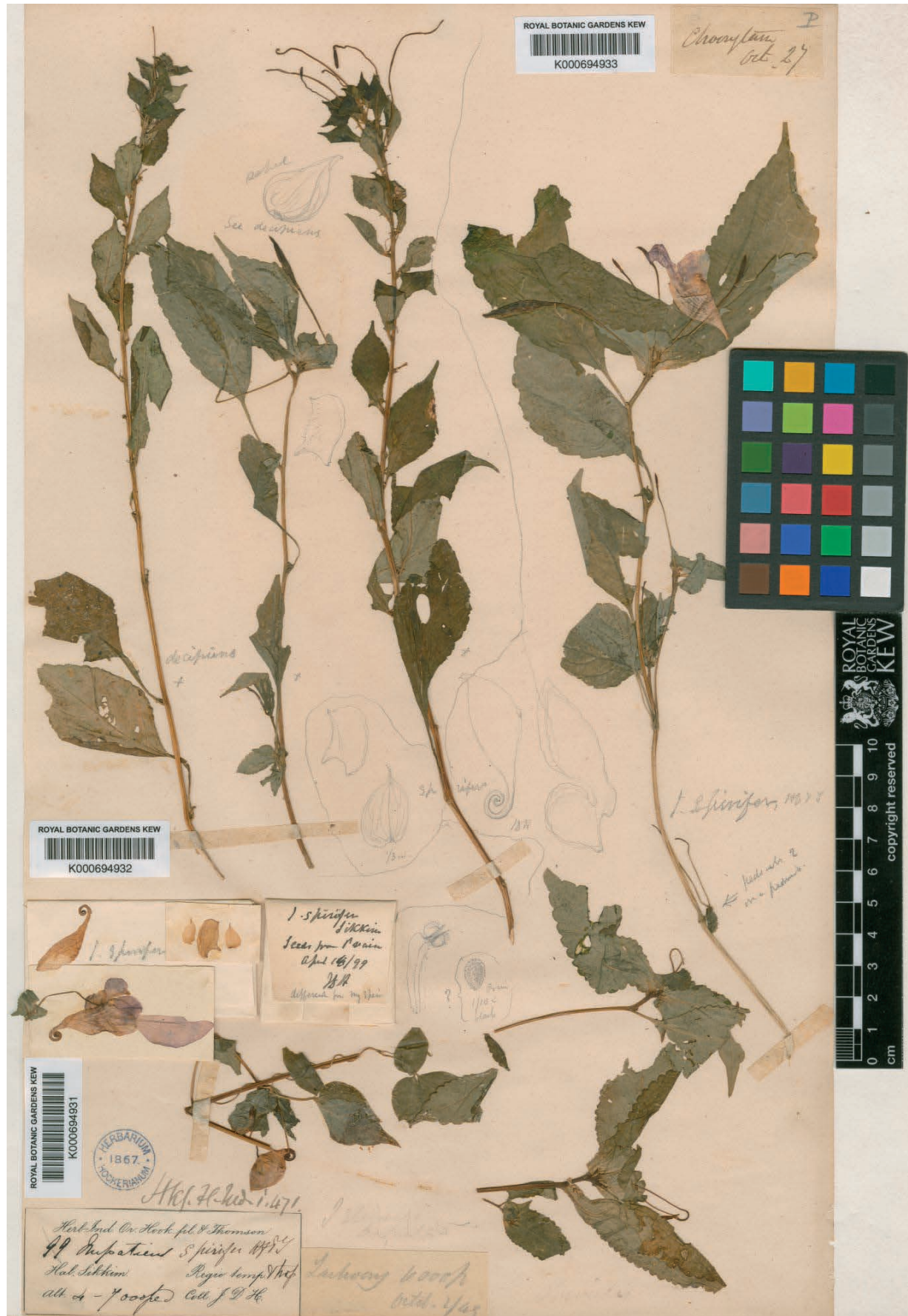
Fig. 1. Lectotype of Impatiens spirifera Hook.f. & Thomson (K000694933! http://specimens.kew.org/herbarium/K000694933)