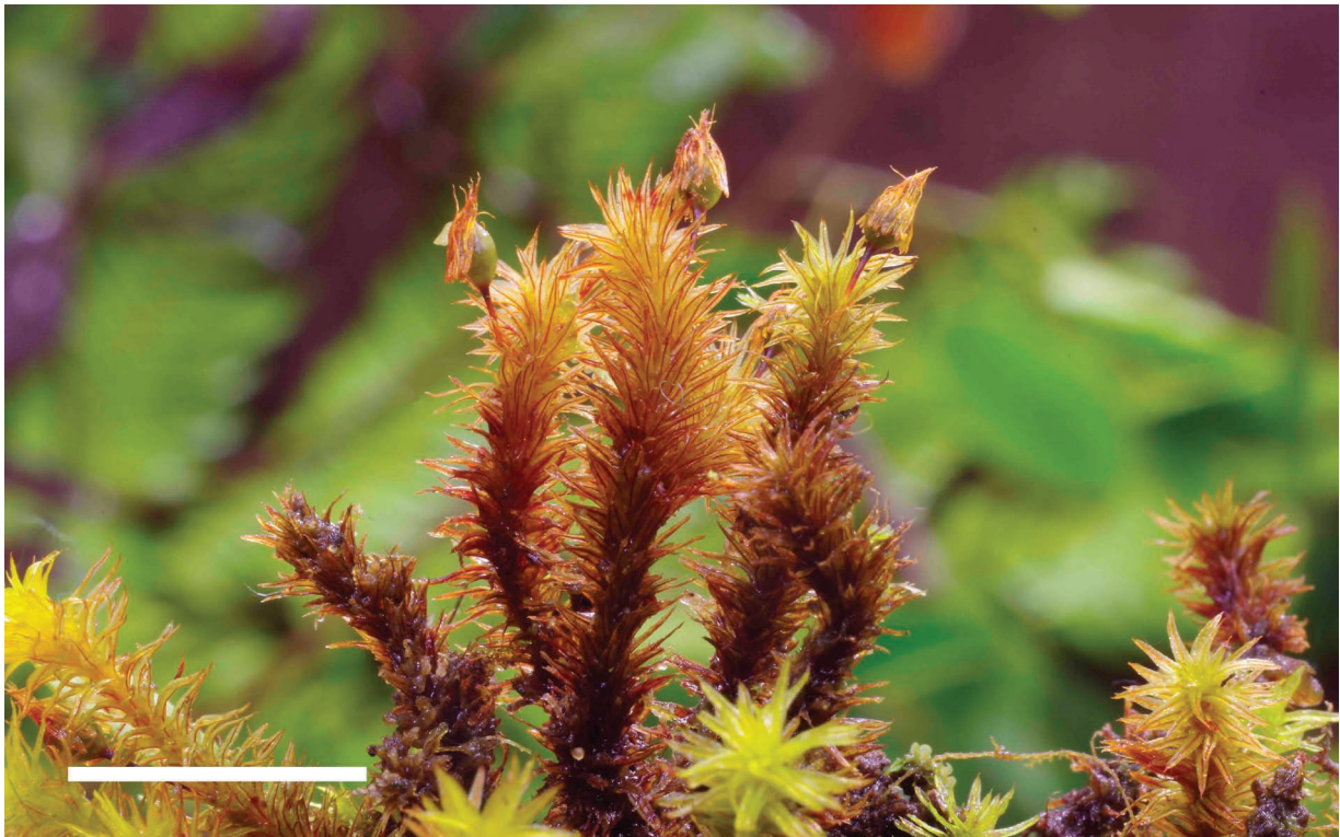
Fig. 1. Macromitrium erythrocomum sp. nov. (Meagher WT-1022 & Cairns). Scale bar: 10 mm.

Perigonia not seen. Perichaetium on a very short lateral branch. Perichaetial leaves triangular-lanceolate, shorter than branch leaves, inner leaves 3.0–3.17 × 0.75 mm; costa excurrent, filling an acumen 0.4 mm long. Vaginulae with a few hairs. Seta short, 3.5–4.0 (–6.0) mm stout, smooth, erect, not twisted. Capsule ovoid-globose when young, narrower when mature, 2.4–3.2 mm long including operculum, 1.0–1.1 mm wide; urn with narrow 4–6 plicate mouth, strongly puckered when dry; operculum conic with upright rostrum 1.0–1.1 mm long; peristome lacking or reduced to a basal membrane; exothecial cells rectangular to elongate-rectangular or rhomboidal, smaller and rectangular quadrate near rim, thick-walled, 18–26 × 45–62 µm. Stomata not seen. Spores anisomorphic, 26–29 µm, and 13–16 µm, surface lightly papillose. Calyptra mitrate, about 3 mm long, plicate, covering but not enclosing the capsule, with erect stiff rusty red hairs 58–62 µm thick, arising from base to top of calyptra and denticulate because of protruding cell ends; base lacerate into 8 segments to top of urn, sometimes with one split longer and the calyptra thus appearing cucullate. Figs 1–3.