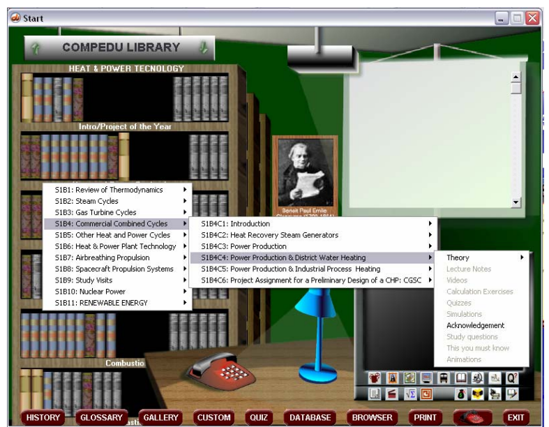
Figure 1. CompEduHPT main interface

In this context, the Division of Heat and Power Technology at the Royal Institute of Technology started to develop Computerized Education Platform (CompEduHPT), an interactive learning platform which sets a new standard for elearning of energy technology in a global life-long learning perspective (Figure 1). The main objective of the platform is to enhance the learning by providing to the students and teachers the necessary multimedia tools. This has been done through the use of a platform in which the information has been collected, processed and presented in a pedagogical way using several multimedia advantages.