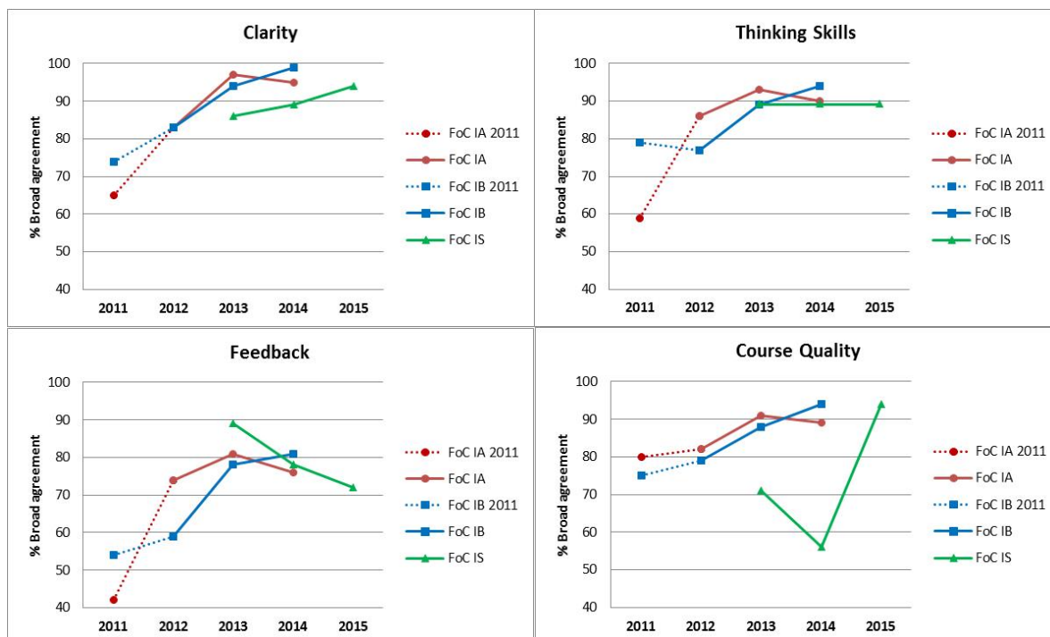
Figure 2. Course SELT benchmark question data for FoC courses 2011-2015

Note: Course SELT data for FoC IA and IB in 2011 is prior to the restructure process