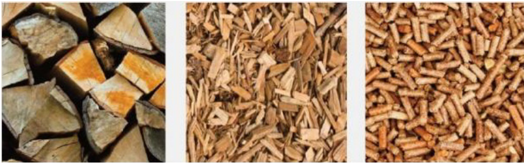
Figure 5. Main types of wood fuel

Wood fuel is a fuel such as firewood, charcoal, chips, sheets, pellets, and sawdust. The particular form used depends upon factors such as source, quantity, quality and application. In many areas, wood is the most easily available form of fuel, requiring no tools in the case of picking up dead wood, or few tools, although as in any industry, specialized tools, such as skidders and hydraulic wood splitters, have been developed to mechanize production. Sawmill waste and construction industry by-products also include various forms of lumber tailings.