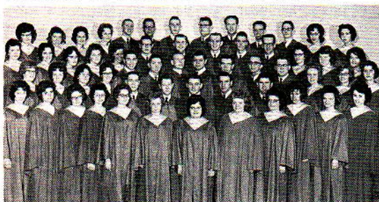
The Fort Wayne Bible College Chorale Home Concert, Sunday, April 12, 3 p.m. Founders Memorial Auditorium

The final program of this series will include organ meditations by F.W.B.C. music students and faculty members. This will be presented at 3:30 p.m., Sunday, May 17.