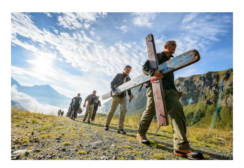
Figure 6. Lampedusa cross on Monte Rosa, Italian Alps.

On April 2014, one year after his visit to Lampedusa, the pope blessed the original cross in Rome, inviting the believers to carry it in pilgrimage "everywhere." During the Extraordinary Jubilee of Mercy, on the day of the "Jubilee of the Migrants" (January 17, 2016), it was displayed in St. Peter's Basilica. It had already been carried over the Alps (Fig. 6) and was later taken to many towns, including Rimini (in 2016), during the annual meeting "Friendship among the Peoples," organized by the ecclesiastical movement Communion and Liberation; York (in 2016), where it was displayed in the Baptistery of St. Wilfrid's Catholic Church; and Barcelona (in 2017), where it was exhibited at the expiatory temple Sagrada Familia.