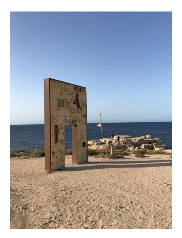
Figure 3. The Gate of Lampedusa—Gate of Europe by Mimmo Paladino.

and a "symbol" recalling "the inhumane death of migrants drowned or missing at sea, which we have passively witnessed," and to transmit its memory to future generations.<sup>52</sup> It is a giant gate open to the Mediterranean Sea, indicating the role of the island as an entrance to Europe. It gives visual substance to the idea of Lampedusa as a border and, at the same time, transforms the land beyond it into a stage. Not by chance, it has become the favorite place for official photos of participants in social and political events on the island, including the recent summit of the police chiefs from nine Mediterranean countries. Even Matteo Salvini, leader of the Northern League, a political movement with a strong anti-immigration stance, posed in front of it for the photographers.