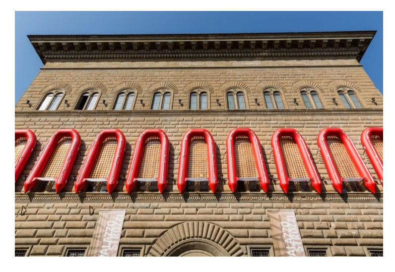
Figure 2. Installation by Ai Weiwei on the façade of Palazzo Strozzi, Florence.

Ai Weiwei's refugee project also reached Italy. From September 2016 to January 2017, a museum in Florence, the Palazzo Strozzi, hosted a large retrospective of the artist. During this exhibition, twenty-two of the imposing windows of the palace (one of the finest Renaissance buildings in Italy) were covered with orange inflatable lifeboats, a memento of the migrants' odyssey (Fig. 2). Also, that installation, entitled Reframe—Nuova Cornice , was devised to draw attention to the refugee crisis. As Ai Weiwei explained in a video message shown at the inaugural press conference, he was excited by the opportunity "to join the great Italian tradition with a contemporary effort" concerning a current human issue.<sup>21</sup>