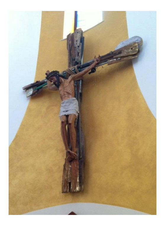
Figure 7. Cross made with oars. Art work by A. Lava Machado. presented by Raul Castro to Pope Francis. Now in the parish church of Lampedusa. (Photo by M. Melotti.)

Do-goodism related to migration has become a main political theme. In this context, the mayor of Milan, Giuseppe Sala, recently requested a migrant boat, to be exhibited in Milan's largest cemetery. Milan is a big city, which regards itself as the moral and economic capital of the country and the "only European town in Italy." Hence its migrant boat also had to be special. Thus Sala strived to obtain the wreck of the most impressive tragedy in recent Mediterranean history: the boat that sank in 2015 with about seven hundred refugees on board.