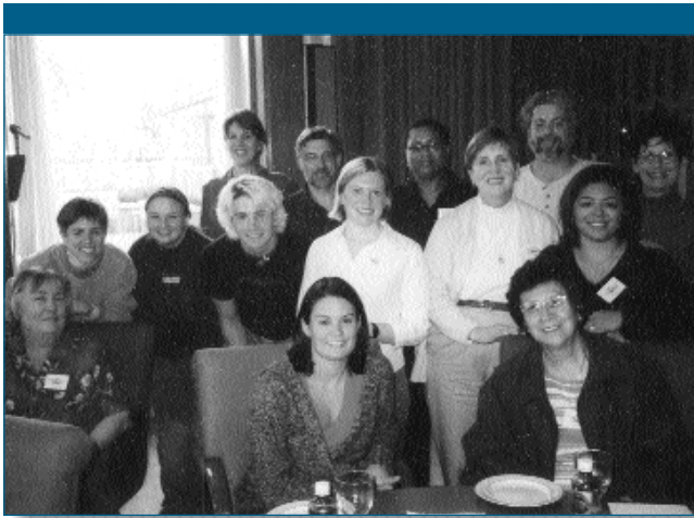
Project Engage participants at the final project meeting held at Wingspread.