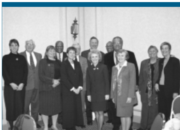
Members of SAGES at the October Meeting

NERCHE SAGES (Senior Academics Guiding Educational Strategies) are leading educators in New England who have either retired, are nearing retirement, or are in a transition phase of their careers. For a complete list of members, visit the NERCHE web site ( www.nerche.org ).