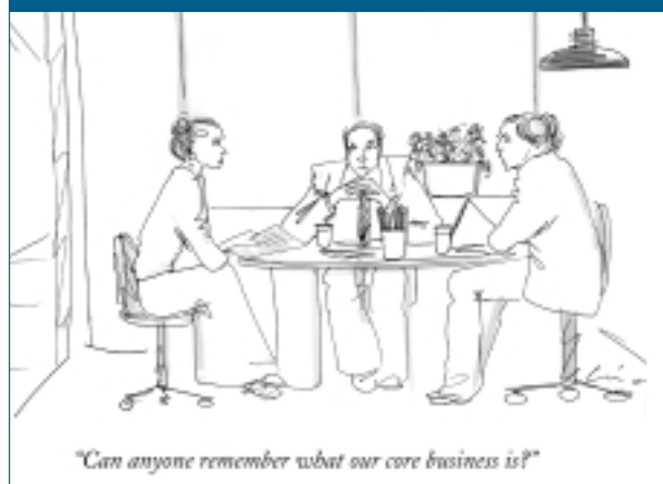
© The New Yorker Collection 1999 Robert Cline from cartoonbank.com

While traditional colleges attempt to maintain themselves as scholarly communities in both their rhetoric and operation, for-profit colleges