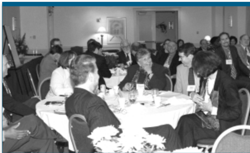
All-Think-Tank Dinner Discussion

CFOs will continue to explore resource development strategies throughout the year by focusing on such topics as entrepreneurial activity, establishing on-campus profit centers, program costs and accountability, and grants.