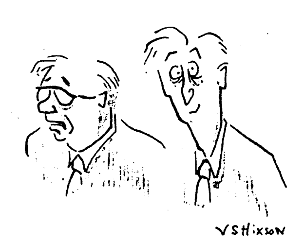
"Bad news. Our money for appointments has been withdrawn. I'm afraid that will leave your committee with nothing to do this year."

Few colleges and universities, private or public, have set specific goals for increasing the number of minority faculty, and they have not developed university-wide faculty hiring policies. However, several public community colleges are establishing goals for the 1990s under the Massachusetts Regional Community Colleges' Affirmative Action Plan and the Board of Regents of Higher Education Plan. Hiring freezes in the public sector have--and undoubtedly will--limit the capacity of these institutions to recruit black and Hispanic faculty.