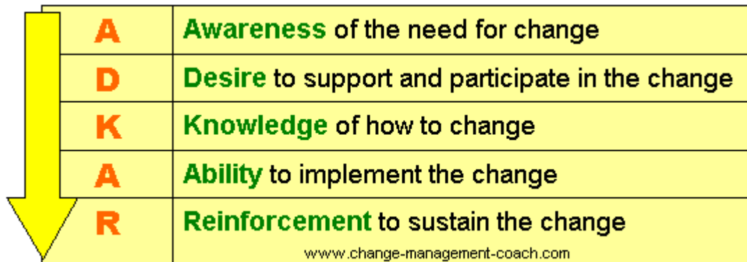
Figure 2. Adkar’s 5 Action Model of Change (change-management-coach.com, 2011)

The above model is consistent with Maslow’s and McGregor’s assumptions that motivation leading to change is a step- by- step process. Hiatt refers to his established 5 actions as building blocks. The process is sequential, meaning that each step or action must be completed before moving on to the next. Hiatt emphasizes that it is not possible to achieve success in one area unless the previous action has been addressed (Hiatt, 2006).