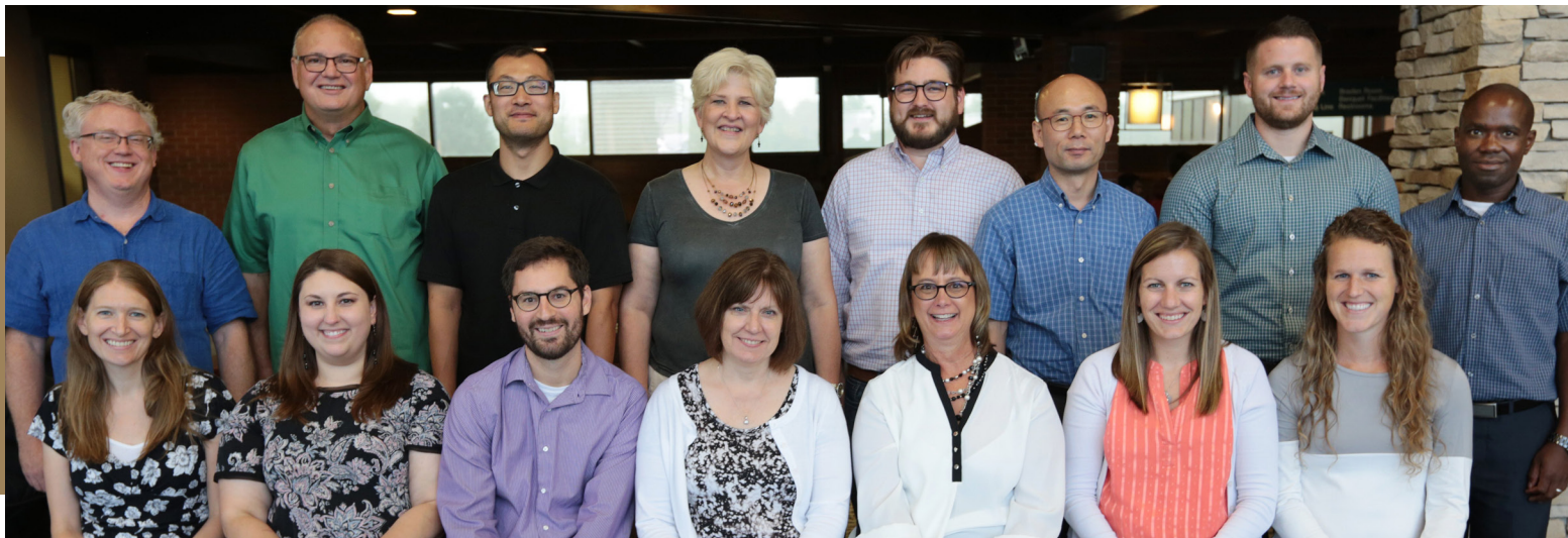
Back Row, Left to Right

And learn about their prior work, subfields, and a fun fact!