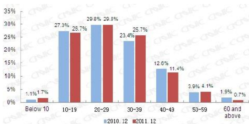
Figure 2: Age structure of internet users (Dec. 2010-2011). 80

Examining the CNNIC’s January 2012 report also indicates how the average Chinese netizen spends their time online. Over 80% of netizens use the internet for instant messaging, and 63.2% use the internet to access video games and connect with other gamers throughout China and the world. 81 In 2011, the amount of digitally published blogs and personal spaces increased by 24 million to 319 million. 82 These blogs are active hubs which netizens use to share news, activities, and opinions. Many of these blogs are linked to micro-blogging websites such as Twitter or Sina Weibo. Social media includes websites which allow for social interaction among large groups of people, with accessible and widespread publishing privileges. Microblogs allow users to post thoughts and commentary within a limited span of characters. Blogs differ from microblogs, allowing users to post content without any character limit. Each medium allows users to follow and share content with one another, while also allowing users to design their profiles to create a personal space within the online community.