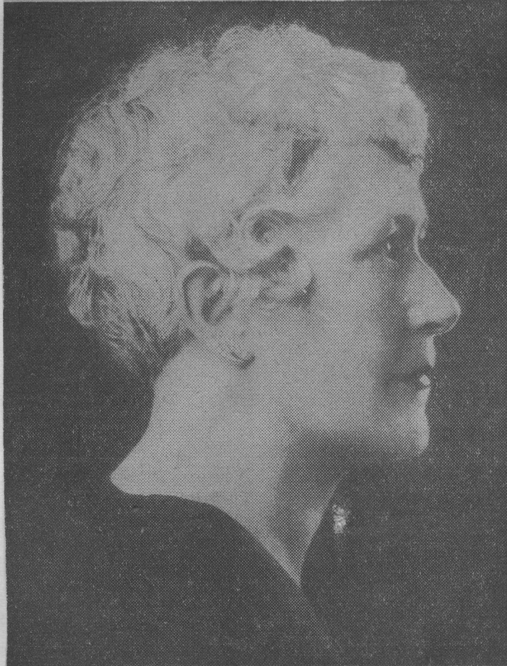
PEN WOMAN DELEGATE

Portland Sunday Telegram And Sunday Pres