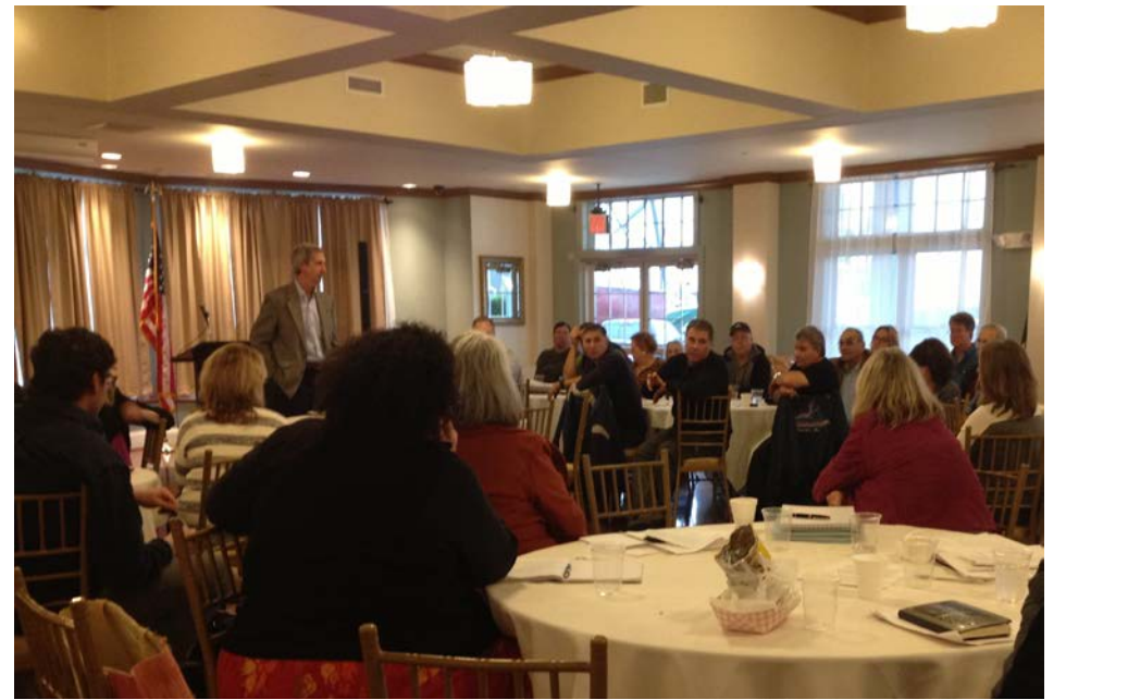
Diverse group of stakeholders gather to discuss the complex issues surrounding the Port of Gloucester.

Our mission is to increase understanding of the marine environment, improve management practices, and promote informed decision making at the local, state, national, and international levels. UHI employs a multidisciplinary approach in all its research and education projects, blending science, policy, and management. Through each successive project, UHI endeavors not only to deliver superior quality products but also to advance the art of marine and coastal management and problem-solving, distinguishing itself by its demonstrated dedication to marine and coastal issues.