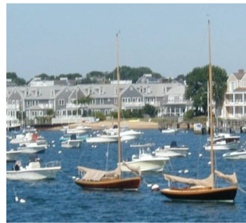
Typical mooring field, Marshfield, MA

Conservation Mooring Study – Harbormasters, boaters, local officials, and manufacturers participated in this study which focused on the impacts of boat moorings in eelgrass beds, looking at (1) the impacts of conventional moorings (shown to create denuded areas, depressions in the seafloor, and impair