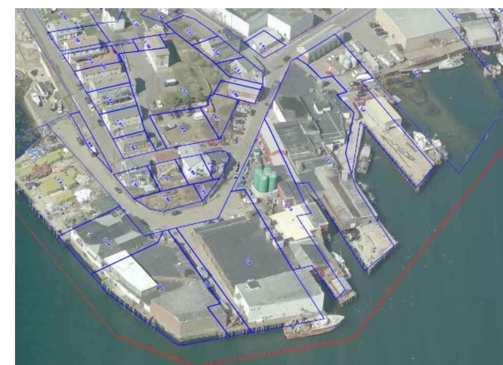
Gloucester DPA Dockage Map

shared information and expertise to help generate this "snapshot in time" report on Gloucester dockage. Determining the current demand and future needs is difficult to capture because of the fluid nature of the fishing crisis. The study offers a baseline for helping develop strategies to accommodate future dockage needs.