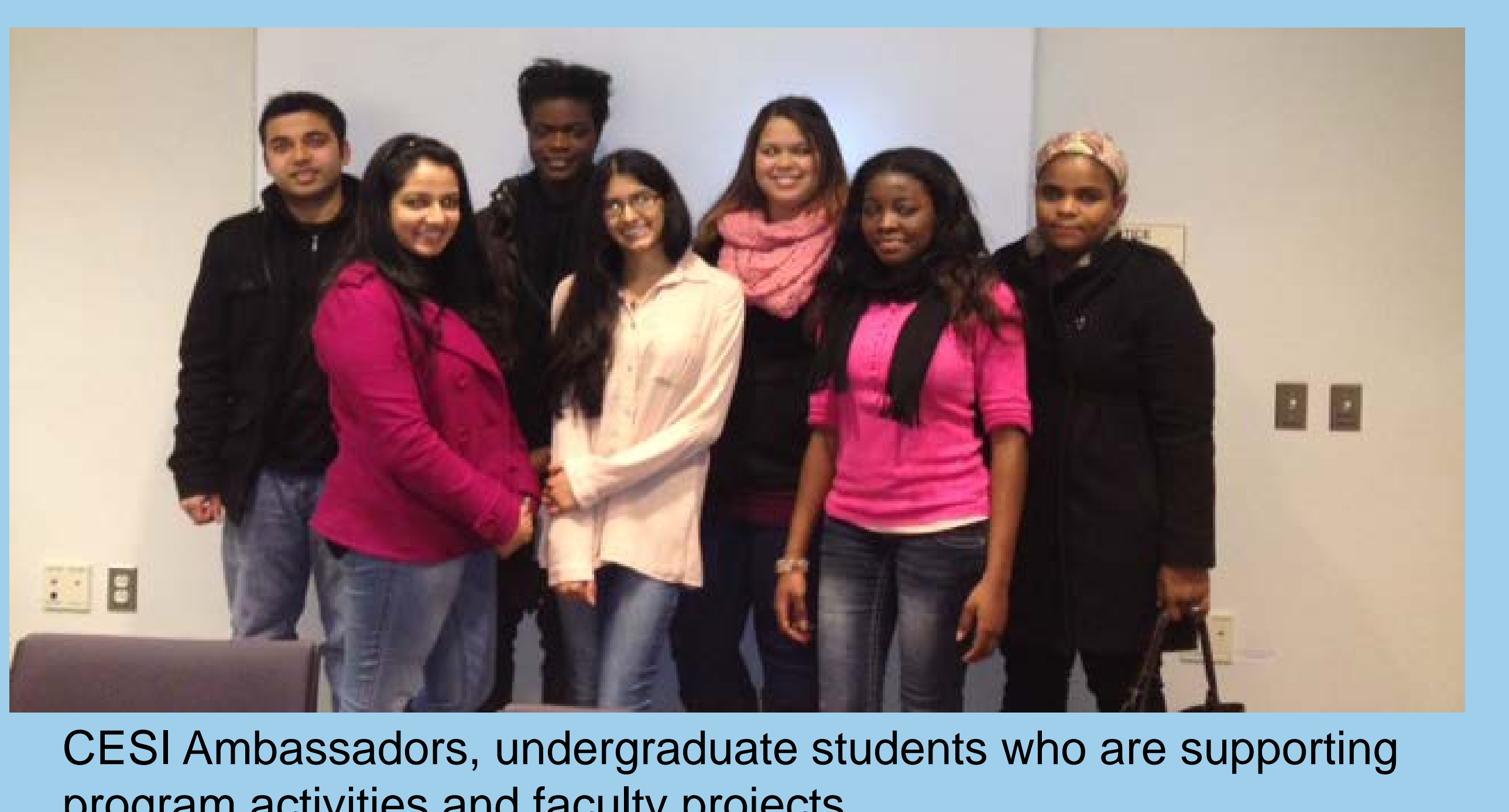
program activities and faculty projects.

The Civic Engagement Scholars Initiative (CESI) is a professional development program that supports faculty and community partners to effectively engage undergraduate students in service-learning and community-based research activities. CESI aims to reinforce classroom learning, foster civic habits and skills, and address community-identified needs.