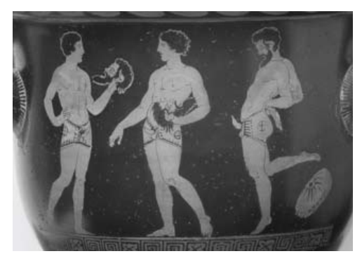
Figure 3: Apulian red figure bell krater. 420-380 BC. Attributed to the Tarporley Painter. The University of Sydney, Nicholson Museum NM 47.5.

their hands (Fig. 3). It has been attributed to the Tarporley Painter and dated to ca. 400 B. C.10. The engraving (Tischbein I 39, Fig. 4) is reasonably accurate, though the liberties taken need to be noted. The three actors have been given a ground line to stand on. Eyes, fingers, toes and strands of hair are more clearly articulated. The engraver has drawn a firmer horizontal line below the pectoral muscles of the figures on the left and in the middle, endowing them with somewhat more muscular chests, more characteristic