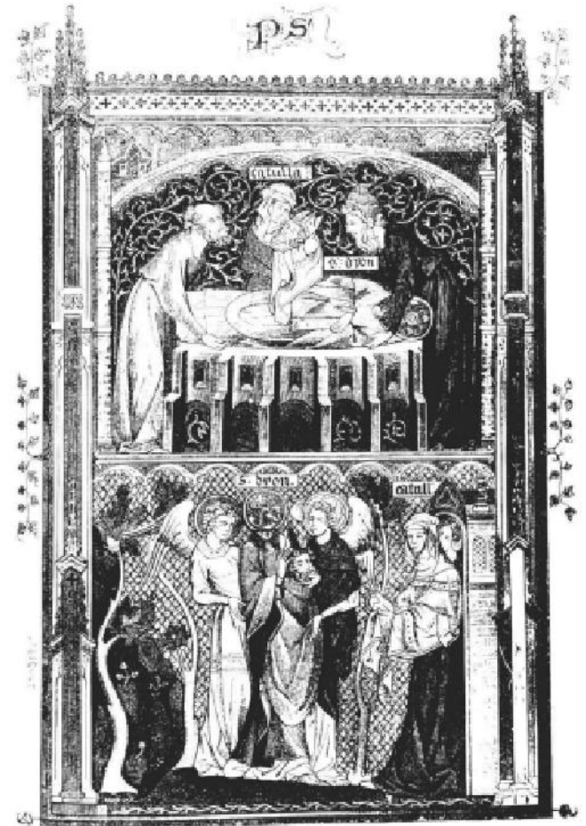
SAINT DENNIS. HEALER OF HEADACHES

1629- 1629 - Area now Whitefield included in Plymouth Company Grant which specified land to 15 miles both sides of the Kennebec to the “ outmost limits of Cobbosseecontee. ”