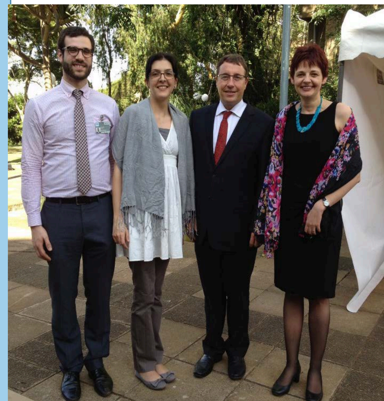
Center for Governance and Sustainability delegation with UNEP Executive Director Achim Steiner

Bringing analytical rigor into policy processes at the global level, the center has actively engaged with the UN and participated in the 2012 Rio+20 conference in Brazil and in the 2013 UN Environment Assembly in Nairobi, Kenya. We produce a documentary film series on global environmental governance featuring interviews with ministers, international organization officials and public intellectuals from around the world.