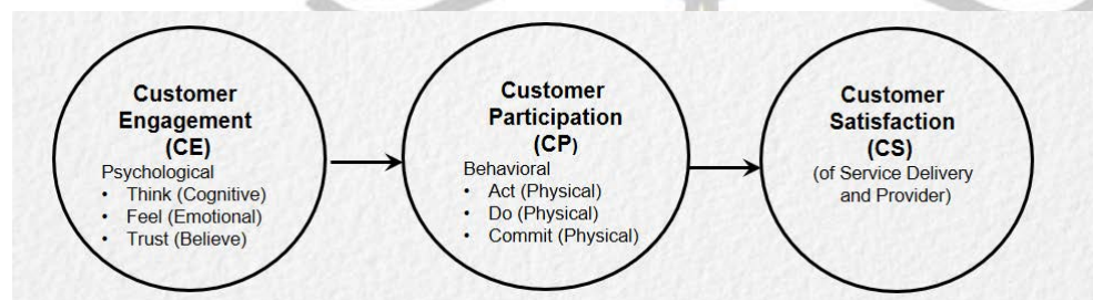
Figure 1 Previous Conceptual Model

The premise of the earlier research was that Customer Engagement was necessary for Customer Participation, which was necessary for Customer Satisfaction.