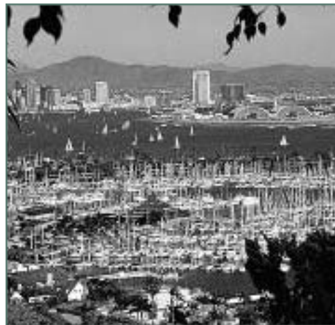
San Diego Bay.

Following successful completion of the pilot study, the Port proceeded with dredging and remediation of 21,000 cubic yards of sediment. Due to a low volume of high copper content sediments and refinements in the physical separation process, the chemical extraction process was not necessary during full-scale remediation. At the end of the physical separation process, cement was added to the low level and washed sediment and the material was placed onsite. The innovative sediment treatment system implemented at the San Diego Unified Port District not only remediated the sediment contamination, it also saved the Port approximately $1.5 million in cleanup costs over other, more conventional methods.