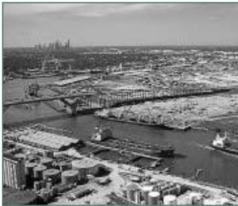
Port of Houston, Texas, Turning Basin Terminal.

In 1995, the Port of Houston Authority (PHA) proposed widening and deepening the Houston Ship Channel. One obvious impact was that approximately 118 acres of primary oyster reef habitat that bisect the channel would be destroyed by the proposed project. Any potential indirect impacts to neighboring reefs were ruled out by the coupling of a hydrodynamic model designed by the US Army Corps of Engineers Waterways Experiment Station and a population dynamics model developed by Texas A&M and Old Dominion universities that permitted full-scale simulations of oyster populations in the area.