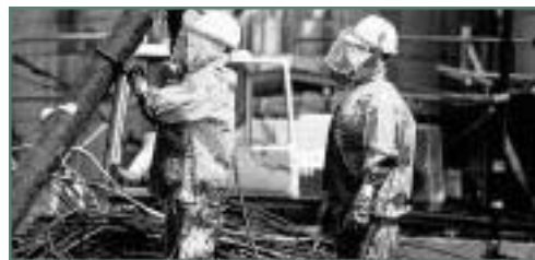
Cleanup of Port of Seattle's Southwest Harbor.

All these efforts have used cost-effective mechanisms and saved millions of dollars in project delays and litigation. Savings of $16 million were possible from on-site containment as opposed to removal of low toxicity soil from contaminated properties.