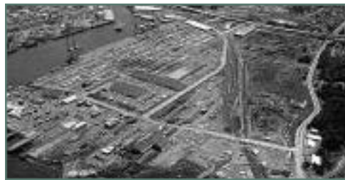
Southwest Harbor before redevelopment.

The five sites were to be redeveloped into a modern container shipping terminal and intermodal rail yard to support increasing trade along the Pacific Rim. In addition to the infrastructure and long-term economic benefits befitting such a project, it also provided an opportunity for habitat restoration and