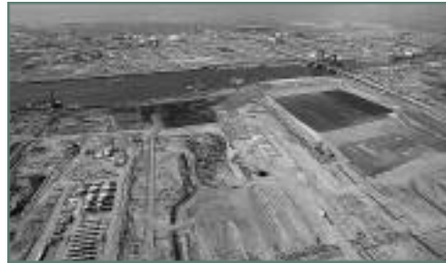
TCL site during remediation.

In March 1994, the Port of Long Beach purchased 725 acres of land, previously operated mostly as an active oil and gas production field, from the Union Pacific Resources Company (UPRC). The Port purchased the property for long-term Port-related expansion, including a new 200 acre marine container terminal. This acquisition included a parcel of land that had, in the past, been leased from UPRC by TCL Corporation for the purpose of disposing off-site oil and gas drilling wastes in shallow impoundments (called “sumps”). Wastes permitted for disposal on the site included rotary mud, crude oil tank bottoms, and oil and water. However, in 1981, soil tests revealed that non-approved toxic substances were also disposed of on the site, and in