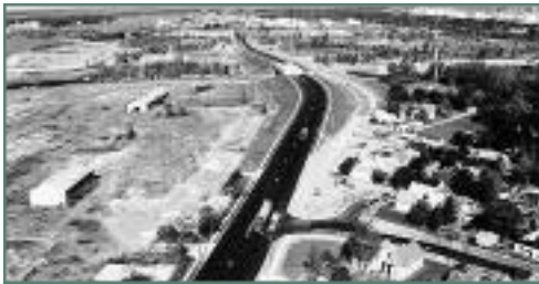
Improved roadways at the Port of Toledo.

Port uses state program to mediate cleanup of non-Port property.