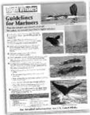
MassPort's Guidelines for Mariners

At the request of the National Marine Fisheries Service, the Port joined with