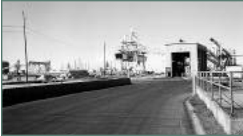
Stormwater filtration system and shiploader.