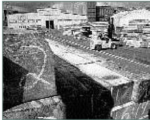
Old growth timbers reused at the Port of Portland.

In addition to maintaining its recycling program, the Port has initiated several innovative projects that recover used materials for alternative uses. In one project, old growth timbers were recovered from an old warehouse. In preparation for redevelopment of a terminal area, the oldest warehouse in the Port was carefully dismantled. The recovered timbers were remilled and then incorporated into other construction projects, such as Port building lobbies and meeting rooms