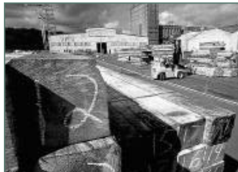
Port of Portland, Oregon.

As with many environmental problems, public concern comes before the necessary programs and regulations to ratify the problem are established. When this group first convened, there were no air toxic programs in place that it could use as a model. Instead, because of its success, this project is now used by the Oregon Department of Environmental Quality as a model for technical and community feedback in its design of a state hazardous air pollution program. The Port of Portland received the 1997 Environmental Improvement Award from the American Association of Port Authorities.