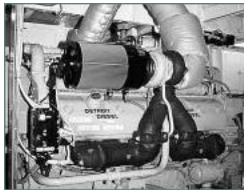
Tugboat modified by the Port of Los Angeles

Two tug-boats were retrofitted by the Port of Los Angeles to incorporate state-of-the-art environmental equipment and design. These boats included features that reduce air emissions, reduce waste