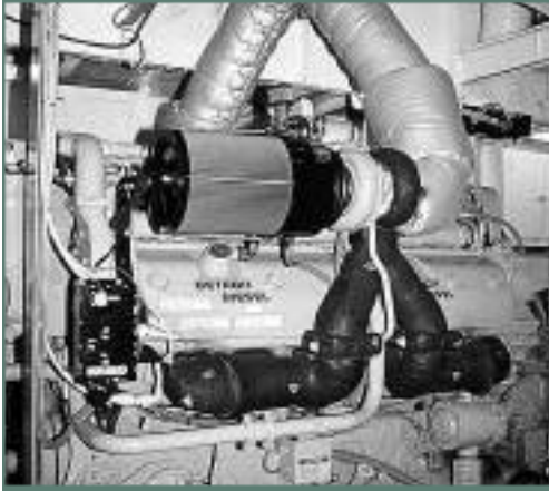
Retrofitted engine inside tugboats.

injection of diesel fuel at lower peak combustion temperatures, and (2) supplying the lowest temperature water by the jacket water-sea water keel cooler to charge the air cooler. With earlier injection, combustion temperature is lower and the adiabatic temperature increase is less. In addition, passing the engine water through the ocean bathes the cylinders in a cooler solution and reduces the air temperature prior to compression, which further decreases the combustion temperature. Keeping the combustion temperature as low as possible optimizes engine efficiency, reducing nitrous oxide, overall emissions, and fuel consumption. The boats now achieve a 25 percent reduction in air emissions. The use of new electronically controlled diesel engines is expected to result in longer time between overhauls, reduced maintenance, better engine performance, and decreased fuel consumption because of increased combustion efficiency and decreased mechanical wear. It was determined that this new design could be retrofitted easily into all pilot boats to ensure that the air emission standards are met.