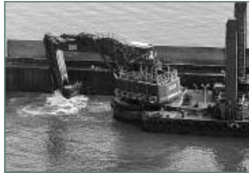
Channel dredging in Boston Harbor.

The unsuitable material removed from the navigation channels and berths is placed on barges while the cells are dug deeper into the parent material of the channels. The silty material is then placed in the cells and capped with a 3-foot layer of