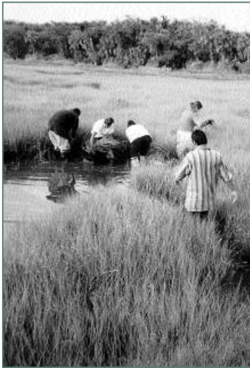
Volunteers harvest saltmarsh grass at Port Manatee.

The Manatee County Port Authority assisted the Florida Department of Environmental Protection (DEP) with implementation of an innovative integrated management system for wastewater discharged from the agency's Stock Enhancement Research Facility (fish hatchery) which is located on Port property. The Port's assistance was sought because of its experience in engineering design and construction and because the Port Authority is a "certified governmental entity" which DEP could contract with at considerable cost savings.