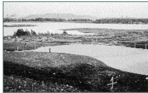
Harborside International as it appeared during construction.

The southeast shore of Lake Calumet, owned by the Illinois International Port District, was used for over 20 years as Chicago’s primary municipal solid waste landfill. Later, it was used by the city to dispose incinerator ash and by the Metropolitan Water Reclamation District to dispose treated wastewater sludge. When these contracts expired, the Port was left with the responsibility of capping and securing the landfill in accordance with Illinois Environmental Protection Agency (IEPA) closure requirements. Recognizing that securing the site over a long period of time would be costly, the Port agreed to convert this land into something more beneficial and aesthetic for neighboring communities. In-house engineering and production brought about a dramatic change in the landscape. This contaminated landfill, along with an adjacent