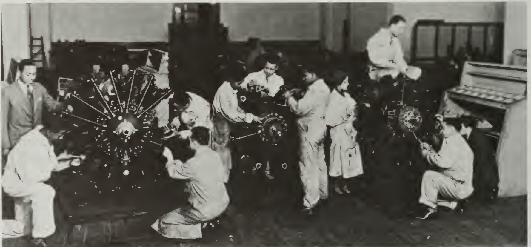
Class in aeronautical training at Curtis-Wright Flying School, Chicago, January 1932

American television, whether commercial or public, has aired next to nothing in which blacks are seen playing a pro-active role relative to a technical field such as aviation. It is no wonder that black youngsters do not strive to move into the technical fields in our society. Research indicates that black youngsters in particular, and black households in general, are among the heaviest television viewers. For the most part, these television viewers have seen virtually nothing on American television that depicts