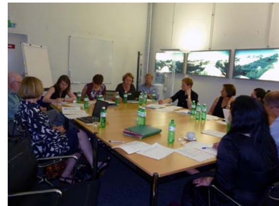
Participants discuss in small groups

“Moving to any of the proposed institutional reform options would present both benefits and risks, and alternatives should be assessed accordingly.”