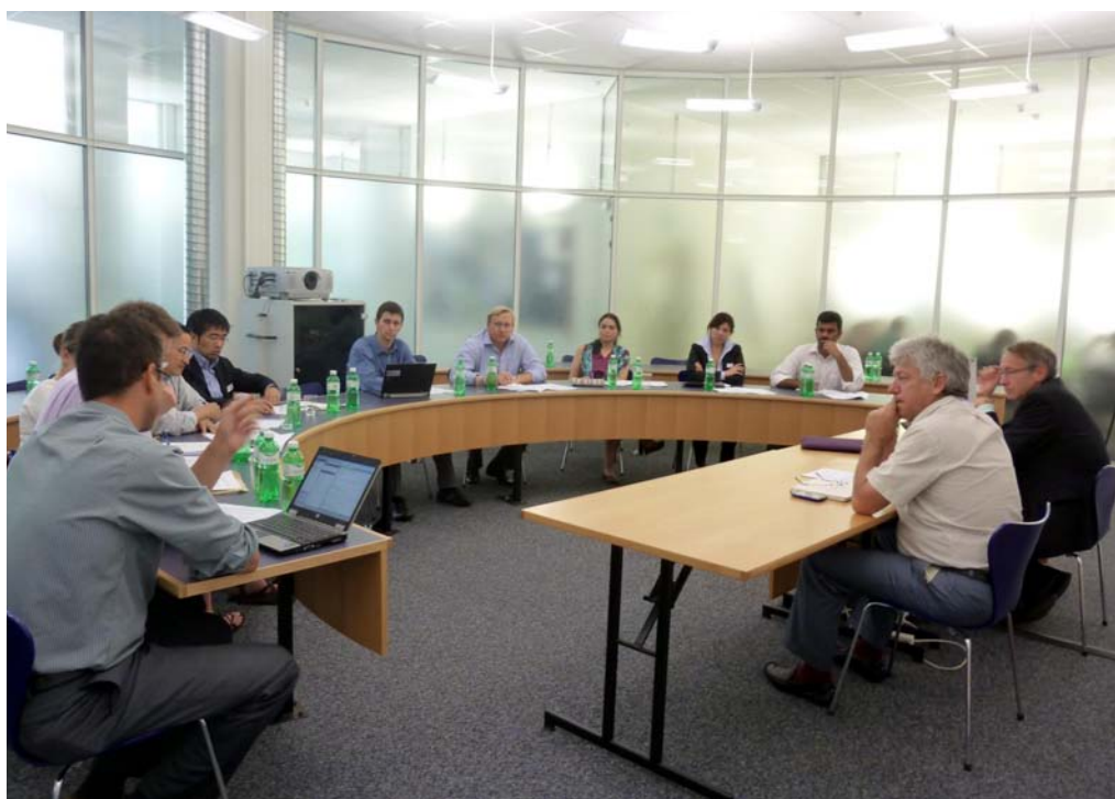
Participants discuss in small groups

Against this backdrop, participants examined the performance of the international environmental governance system and UNEP in particular as the anchor institution for the global environment and thought through reform options for the international environmental regime.