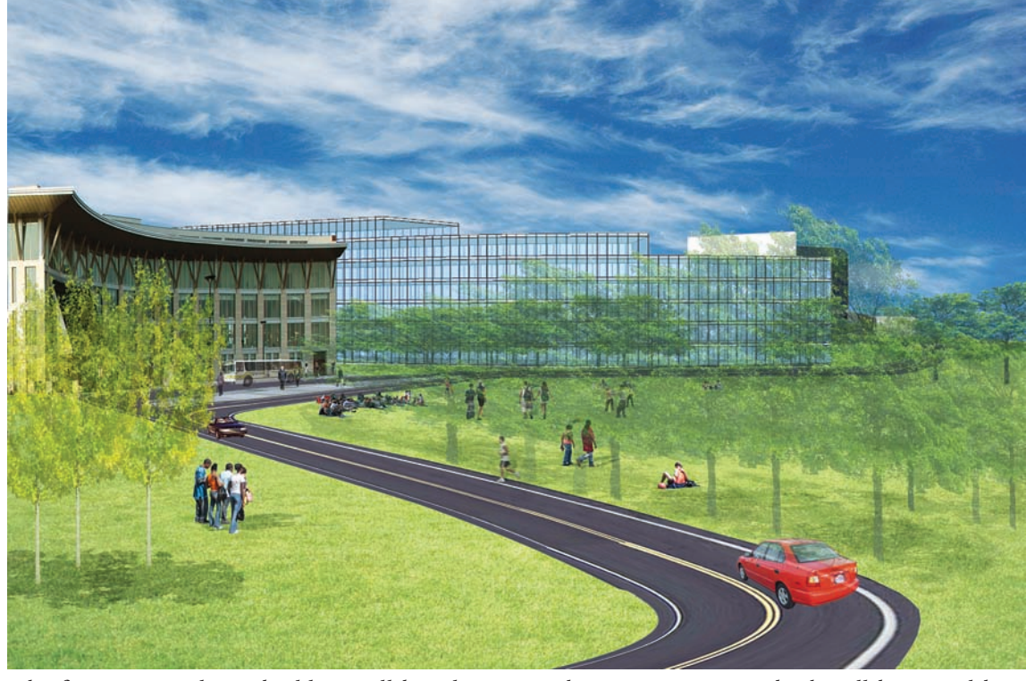
The first new academic building will be adjacent to the Campus Center; both will be served by a reconfigured roadway. (Image courtesy of Chan Krieger Simeniewicz)

Nearly coinciding with the funding approval was the selection of the Boston architectural firm Goody Clancy to conduct a programming study and preliminary design for the campus's first new academic building in some 35 years, an Integrated Sciences Complex. The new building,