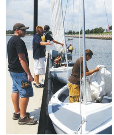
Left to right: An instructor leads two new sailors down the dock; the new pumpout boat; getting ready to set sail.