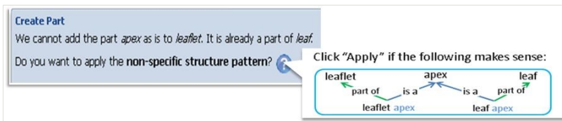
Figure 2. doi

When the user adds a term to the ontology, the online open Ontology Editor is invoked, presenting different patterns to relate the terms in semantic ways (e.g. assert utricle in Carex \equiv perigynium in Carex , spike is_a inflorescence , spikelet \equiv secondary spike or small spike , stout \equiv strong and increased size , weak \equiv decreased magnitude or decreased strength ). Ontology design patterns (e.g. Egaña et al. 2008; Presutti et al. 2012) can be used to wrap the complexity of the logic in a friendly user interface so that users lacking description logic training can use them. For example, non-specific structures, such as apex, surface and base, that can be part of many different structures need to be treated with several logic assertions. Our software can detect cases like this and automatically generate the complete set of assertions for the user to approve (Fig. 2).