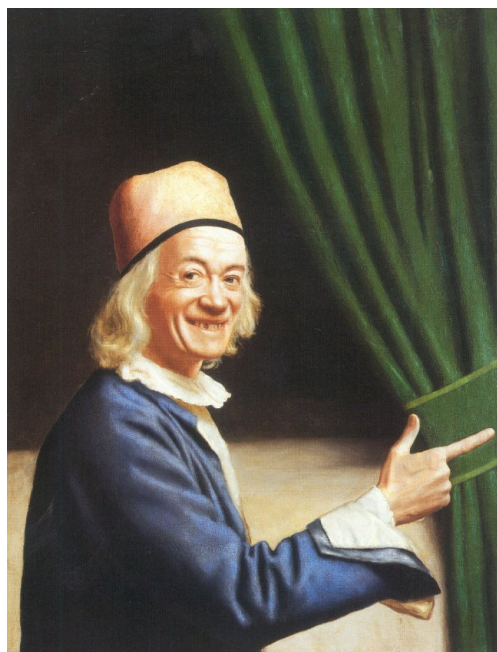
1. Jean-Etienne Liotard, Self-Portrait Laughing , c. 1770, oil on canvas, 84 x 74cm, Geneva, Musée d'art et d'histoire.

In the course of his life Jean-Etienne Liotard (1702-1789) represented himself numerous times in various media including pastel, oils, and enamel. His self-portraits stand out in his oeuvre as some of his most dramatic, fascinating, and quite literally, spectacular works. Of all Liotard's self-portraits the enigmatic Self-Portrait Laughing , showing the artist grimacing and pointing off-stage, is perhaps the most overtly theatrical. Made when Liotard was around sixty-eight years old, it depicts the artist standing in a dark interior next to a curtain and pointing with a crooked finger at something unseen and unspecified to the right. Both the artist's grinning expression and pointing gesture are calculated to capture the viewer's attention. Although we do not know whether the self-portrait was a commissioned work, there is no doubt that Liotard considered it as among his most highly-prized works for it remained in his collection until his death when it passed to one of his five children. Liotard also mentioned the painting in his Traité des principes et des règles de la peinture (1781), where he refers to it as a model of illusionism and finish. 3