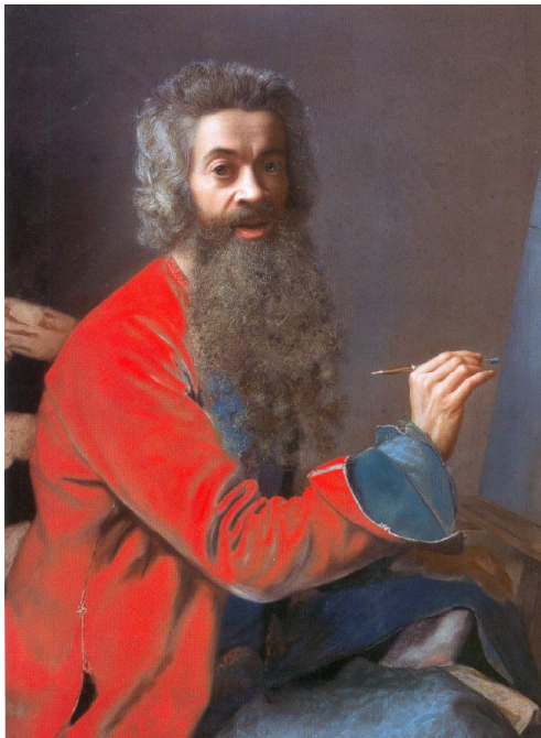
2. Jean-Etienne Liotard, Self-Portrait with Beard , c. 1749, pastel on paper pasted on canvas, 97 x 71cm, Geneva, Musée d'art et d'histoire.

Liotard continued to dress in Turkish clothing throughout the rest of his career, creating a sensation that helped him develop a huge and devoted clientele some of whom commissioned Liotard to make their portraits in Turkish dress. 7 This was the case of the Irish archaeologist and theologian Richard Pococke (ca. 1738-42, Geneva, Musée d'art et d'histoire) who, like Liotard, is attired in a Turkish costume and wearing a beard.