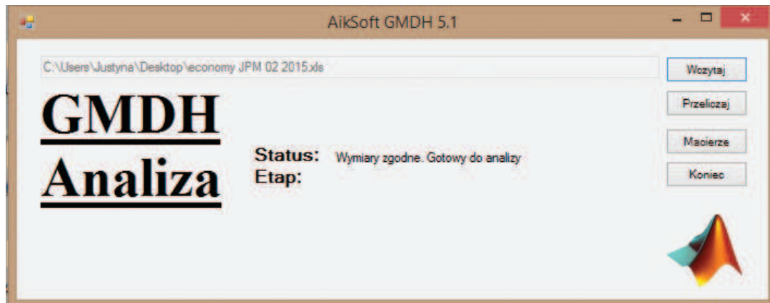
Figure 2. GMDH usage in the Consulting IT computer software system

The data was received from 119 Polish manufacturing companies, and the variations of the GMDH algorithms (Fig. 2) (Farlow, 1984) were investigated in the author's Consulting IT computer software system (Patalas-Maliszewska, 2013).