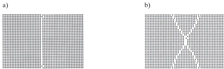
Fig. 2. Evolution of crack's path shown for central part of model, undergoing two types of force excitations: a) straight path observed for axial stretching, captured at 100 \mu s; b) skew paths for fatigue observed at 7 \mu s. For better visualization, displacements shown are scaled by 50 with respect to actual ones

The exemplary results of the peridynamic simulations that are shown in the paper reflect the mechanisms of the growing and branching cracks (crack bifurcation) identified for various excitation regimes (Hu et al. 2012). Depending on both the increase ratio and nominal value of amplitude of the force acting on a deformable body, different physical behaviors of an emerging crack may be found. This observation refers to the experimental results, as in the case of high-strain deformations for composites described in (Haque, Ali 2005; Meyers, Chawla 2009). Since the definition of a peridynamic model allows for integral and potential-based formulations (i.e., a more-physical description of the interactions in an elastic body at the micro- and nano-scales), it is expected to model the crack's growth reliably and the phenomenon of its bifurcation employ more-realistic scenarios. The present work shows the straight and skew paths for a growing crack in a model with ongoing slow axial stretching as well as the fatigue where the different rise factors for the amplitudes of the forces are applied.