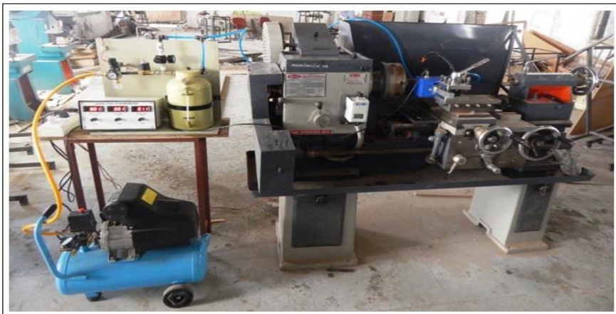
Figure 1. Experimental set up

Since number of input and output parameters are more, there are huge number of possibility of combination to perform the experiments. 3^3 full factorial design by one replica is selected for investigation. Testing is conducted on AISI 4130 bar of 60 mm diameter. Carbide tipped single point cutting tool is used for the investigation. Testing is done for three different cutting conditions namely dry cutting, flood cutting and MQL cutting.