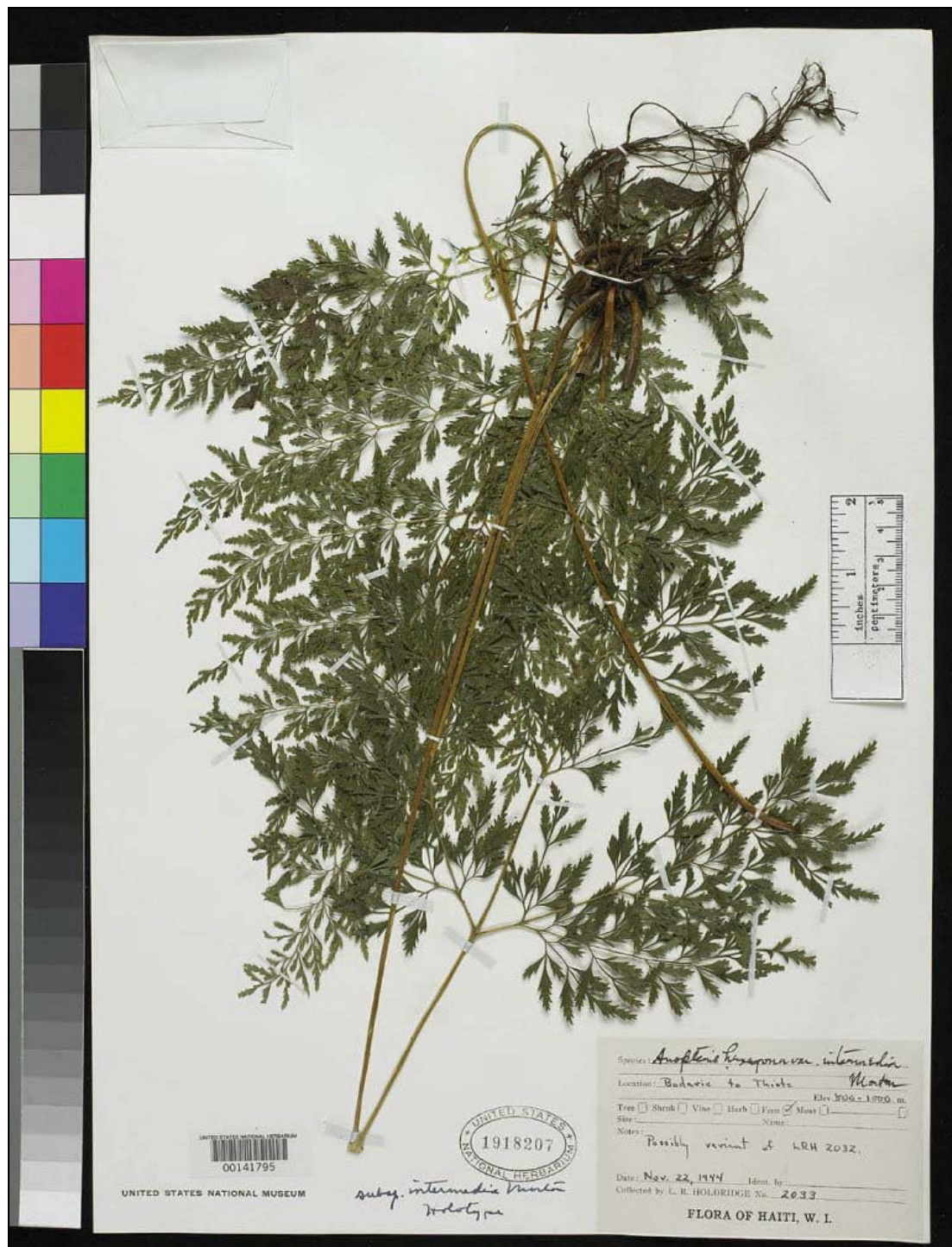
Fig. 3. Holotype of Anopteris intermedia (Morton) A. Vaganov et Shmakov (US)

3. A. intermedia (Morton) A. Vaganov et Shmakov, 2010, Turczaninowia, T. 13 (1): 10. – Anopteris hexagonica subsp. intermedia Morton, 1957, Bull. Jard. Bot. Etat 27: 583.